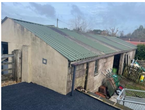
Plate 1: The Barn (Eastern Aspect)