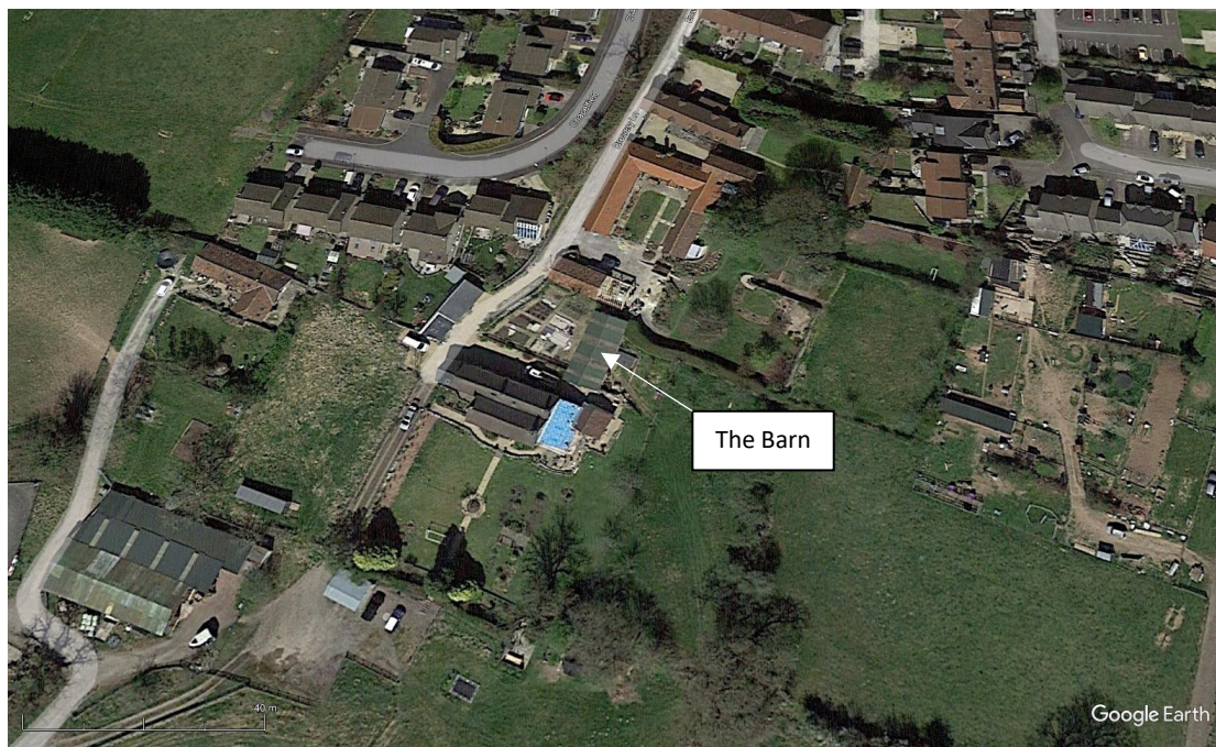
Figure 1: Site Location

The remainder of this report provides methods, results and a discussion of potential impacts including, where necessary, a suitable mitigation strategy.