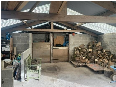
Plate 5: Barn Interior