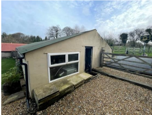
Plate 3: The Barn (Southern Aspect)