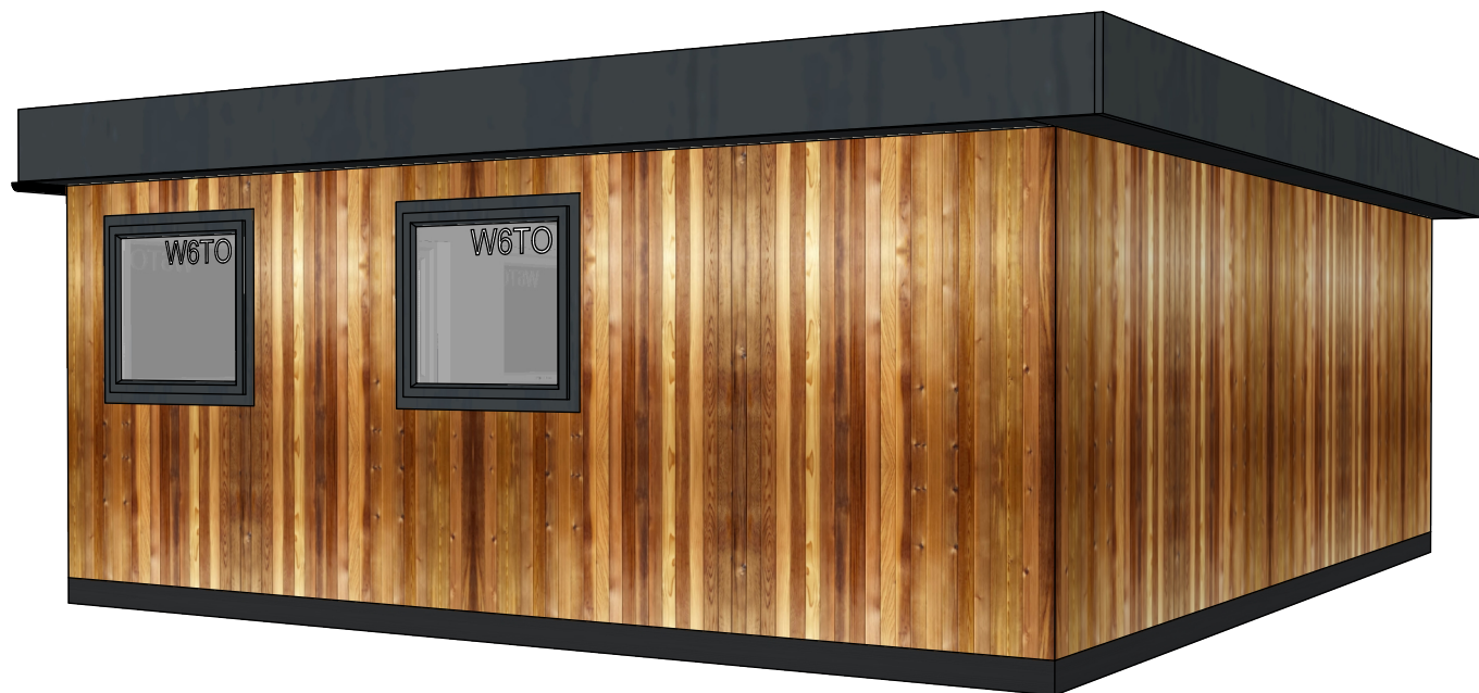
Visual 1 | Not to scale