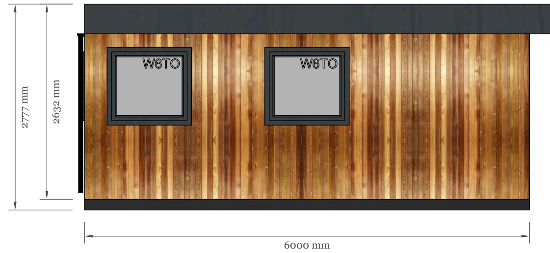
Left Side Elevation View - 05 | 1:50 @ A3