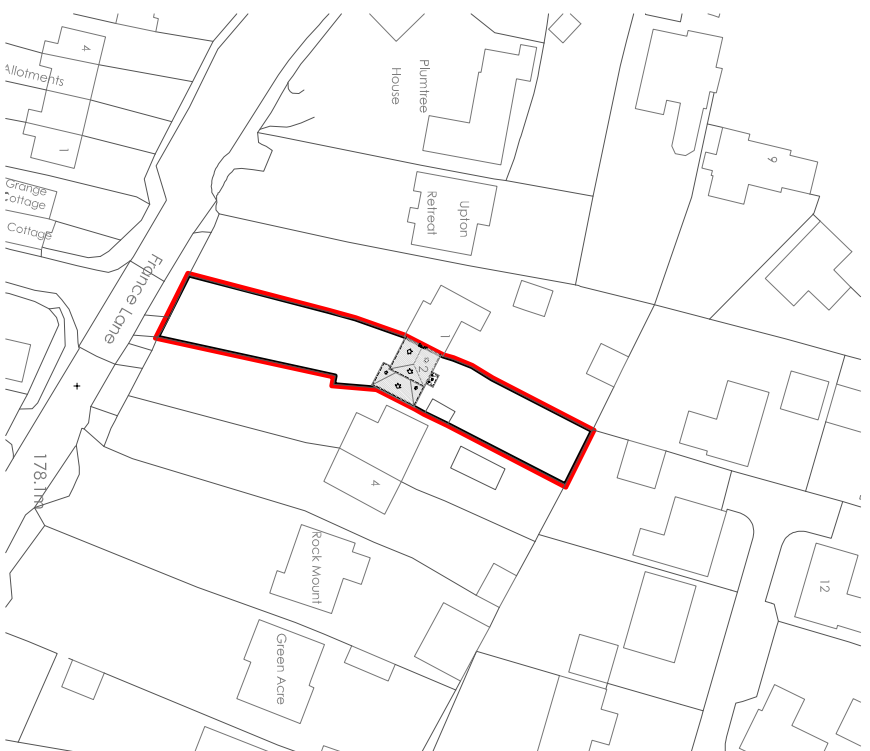
Site Location Plan - 1:1250