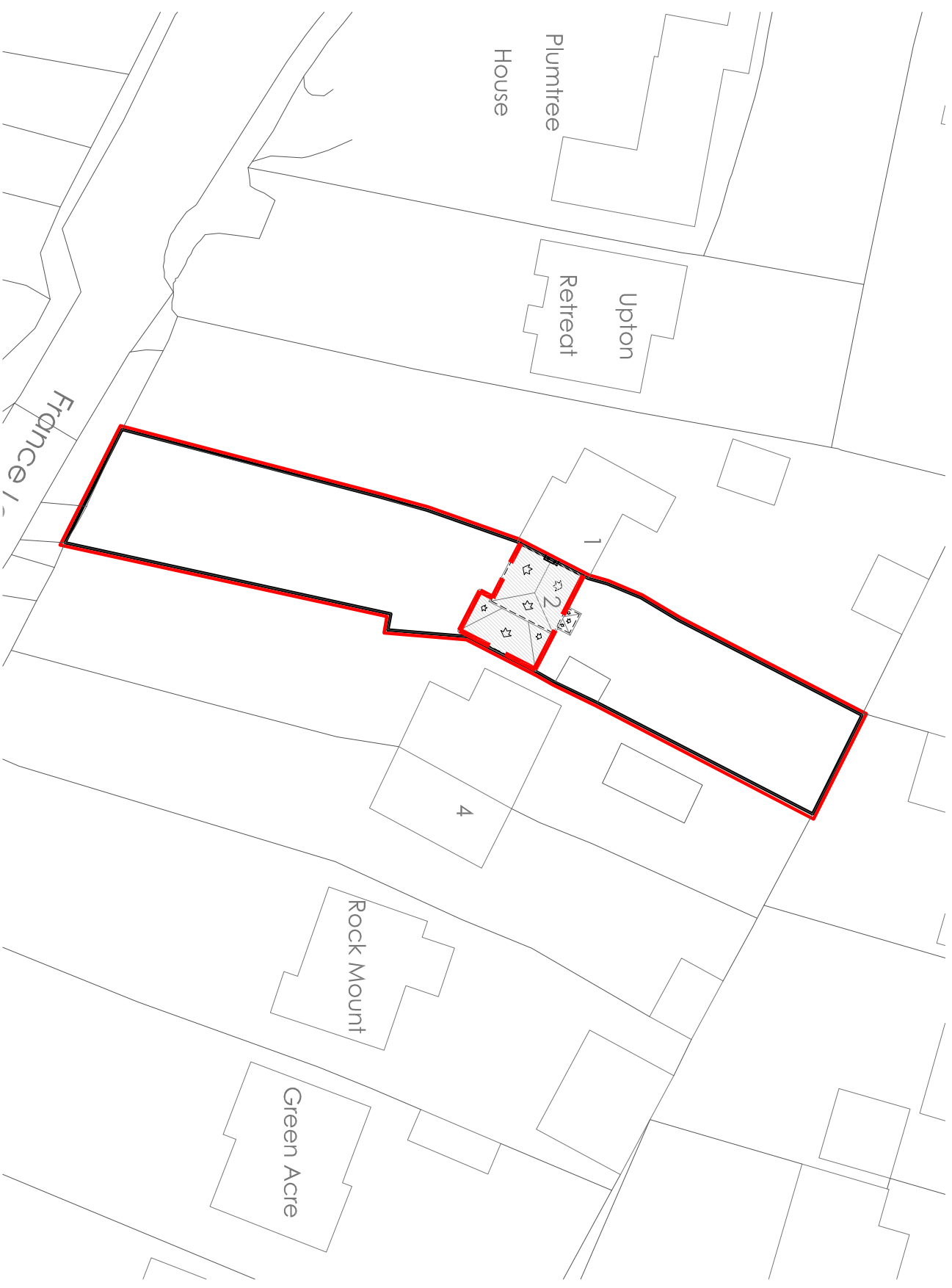
Block Plan - 1:500