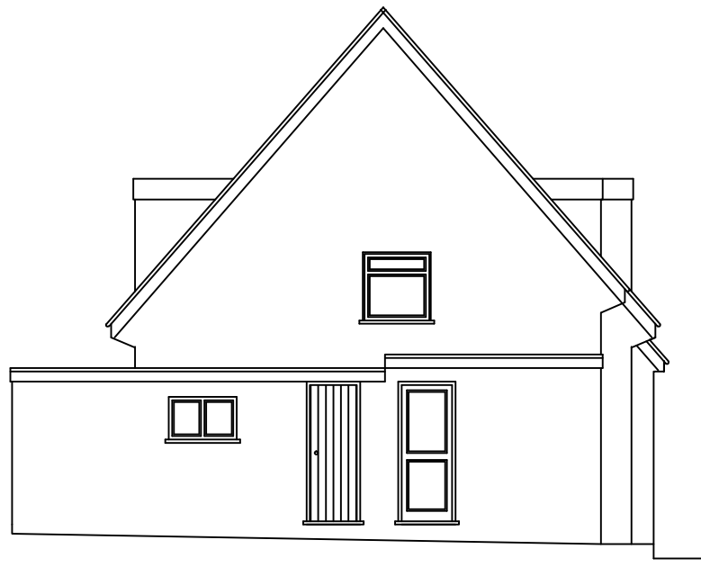
Existing North Eastern Side Elevation