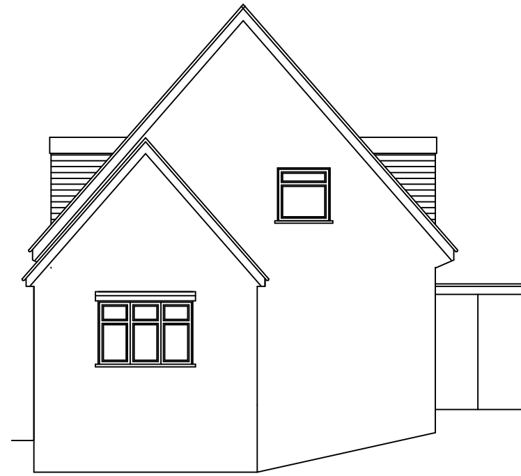
Existing South Western Side Elevation