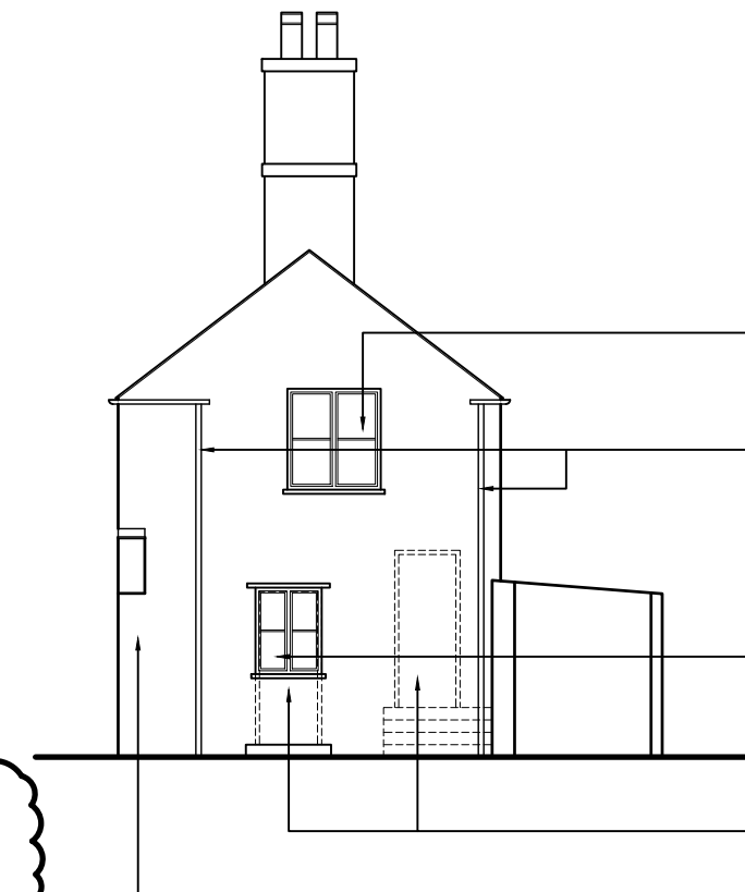
Proposed East (Side) Elevation