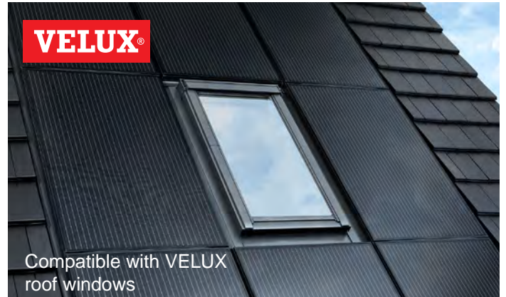
Compatible with VELUX roof windows

1 Design resistance to ultimate loads includes a partial material safety factor of 1.0