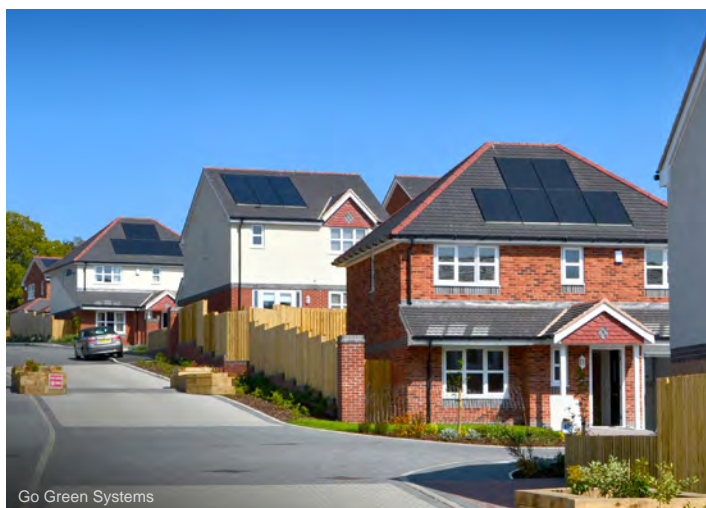
Go Green Systems