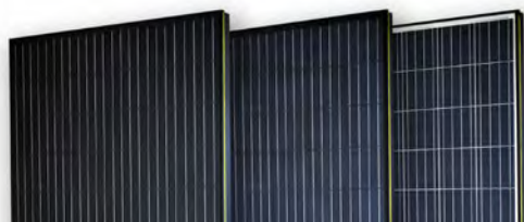
Available in a range of panel power output and styles