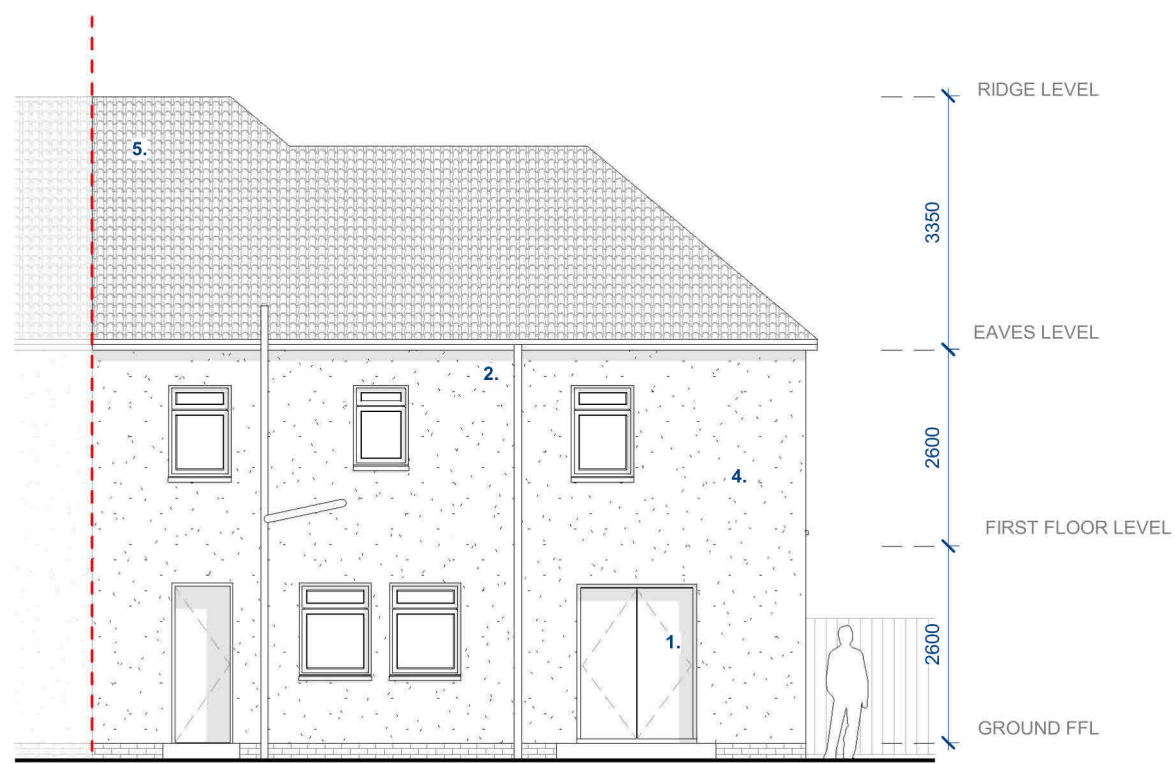
EXISTING REAR ELEVATION (NORTH) 1:100