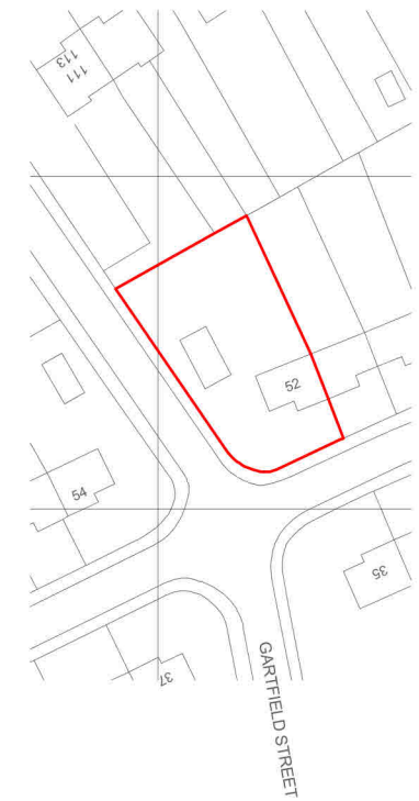
SITE PLAN 1:1250