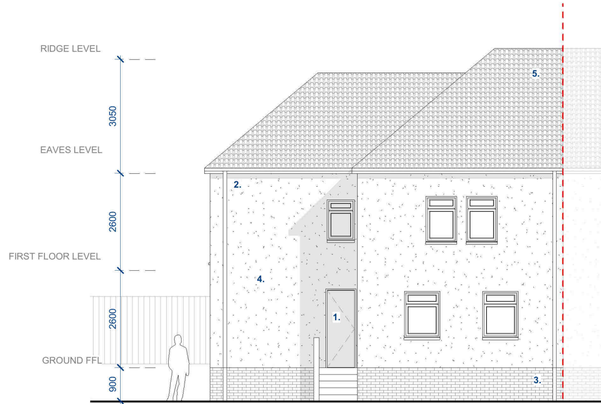
EXISTING FRONT ELEVATION (SOUTH) 1:100