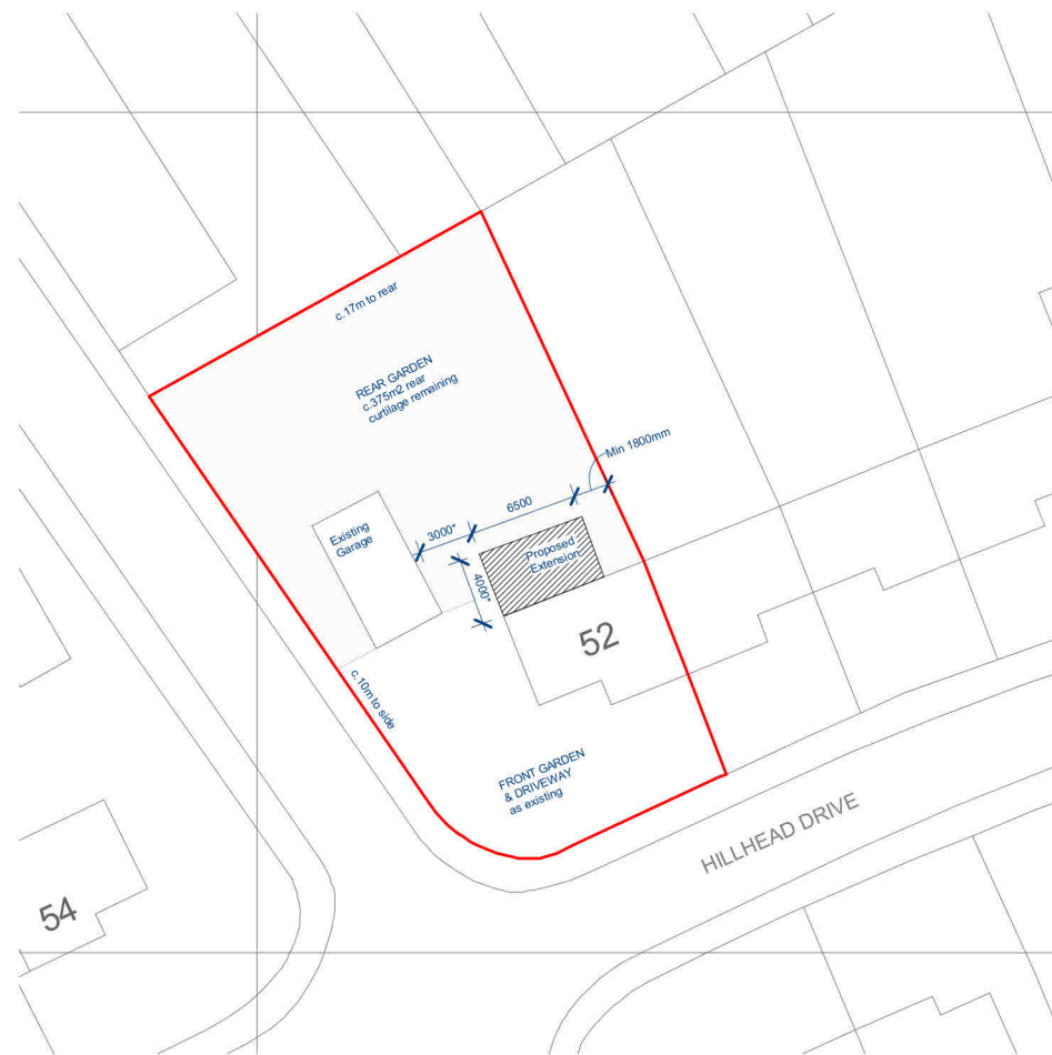
PROPOSED SITE PLAN 1:500