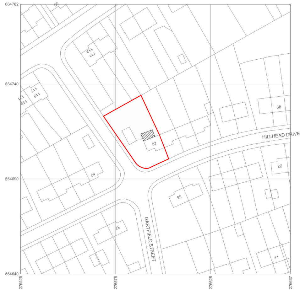
PROPOSED LOCATION PLAN 1:1250

Drawings set prepared for Planning & Building Warrant approval only. No liability will be accepted for omissions on warrant drawings should they be used for construction purposes.