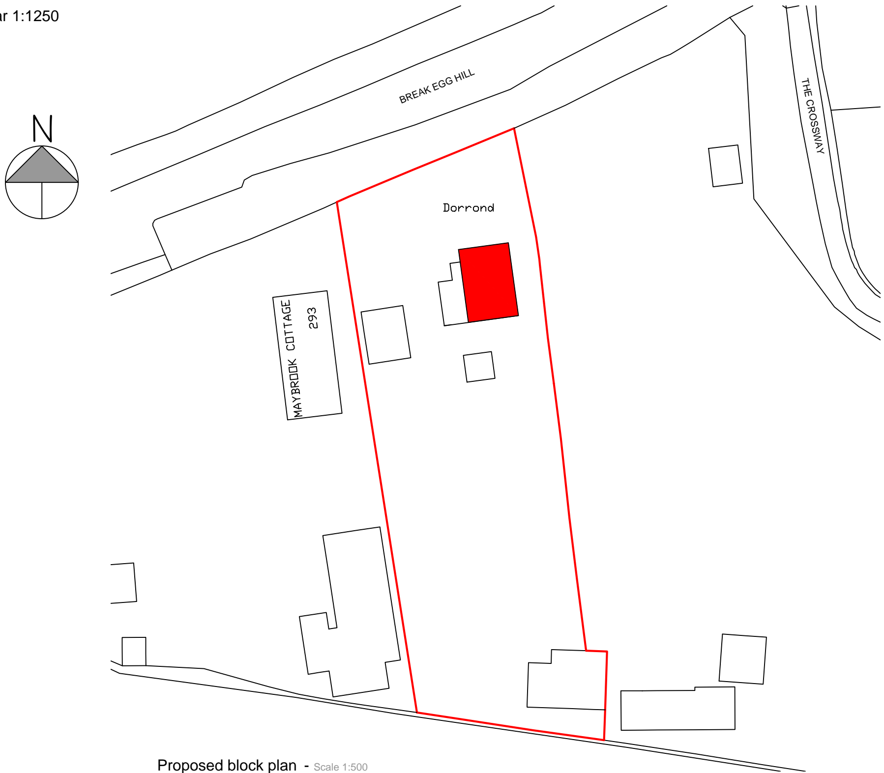
Proposed block plan - Scale 1:500