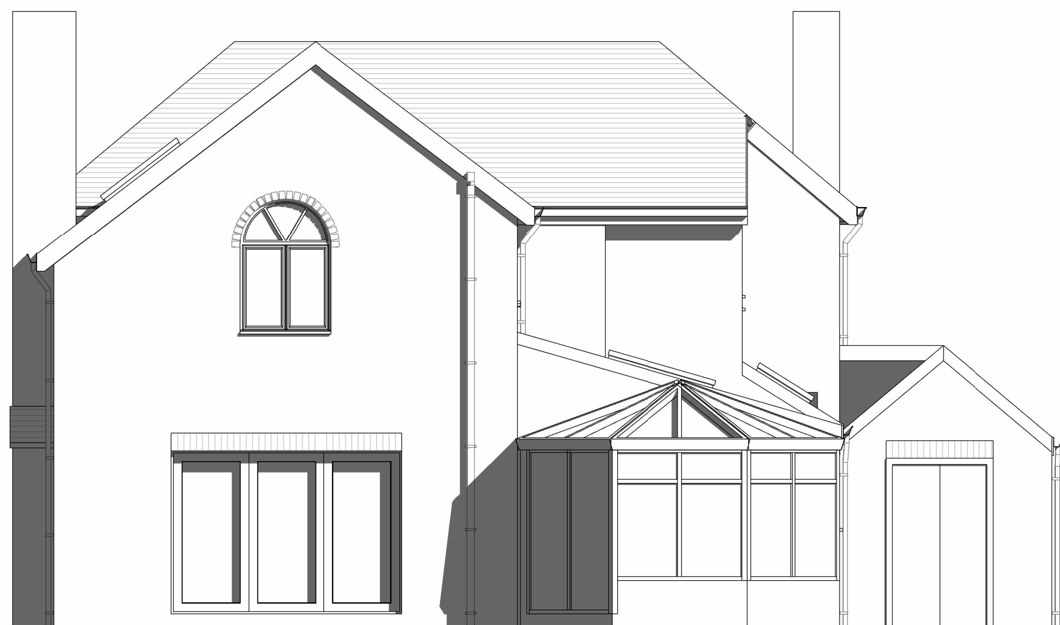
③ Existing Rear Elevation 1 : 50