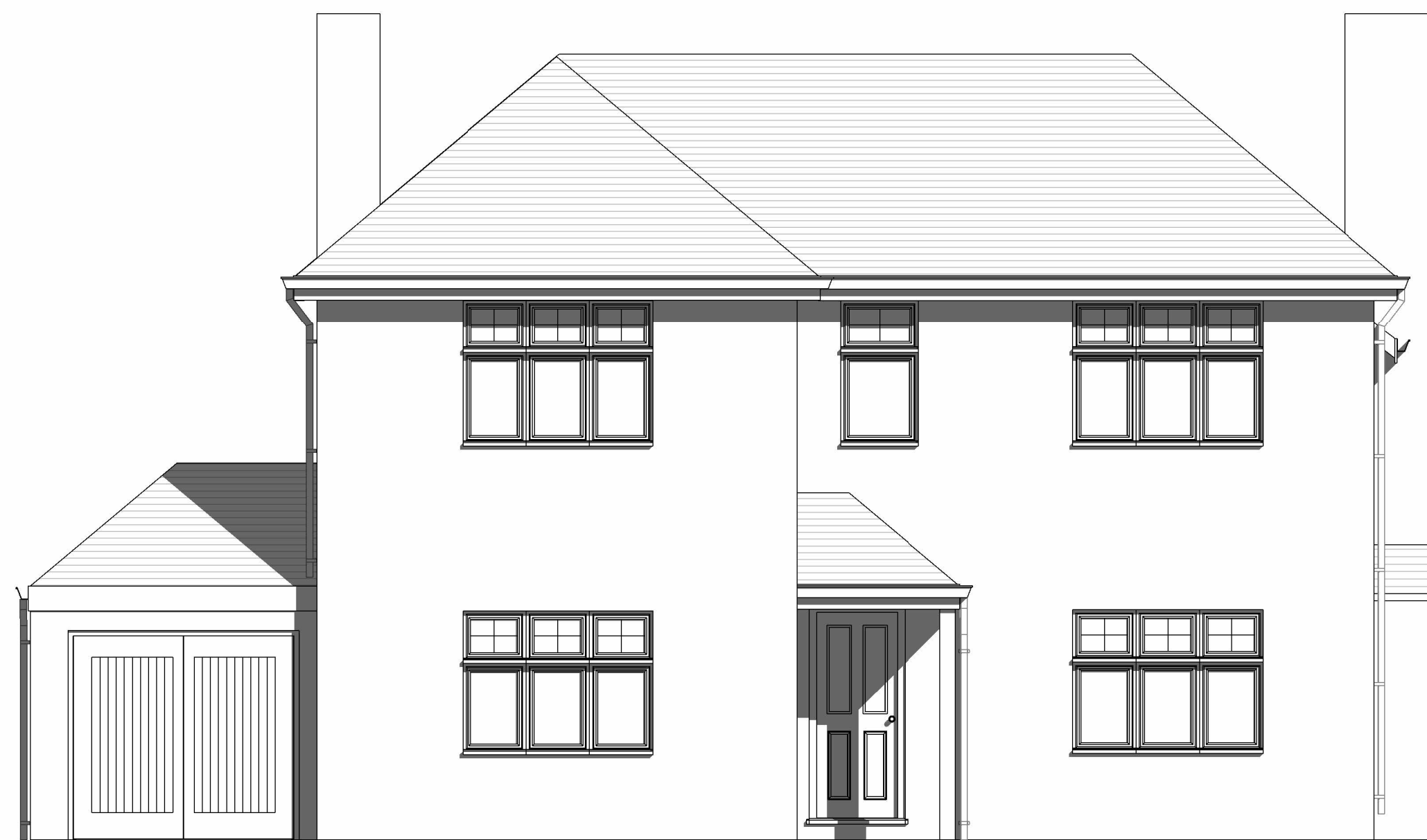
① Existing Front Elevation 1 : 50