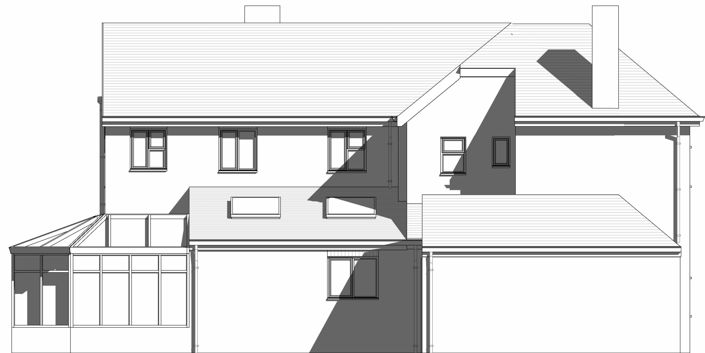
② Existing Side Elevation_1 1 : 50