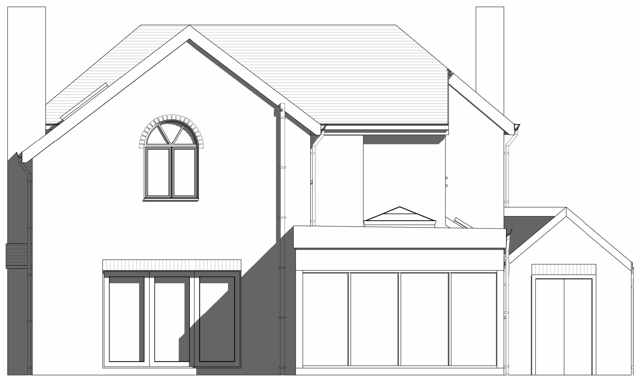
③ Proposed Rear Elevation 1:50