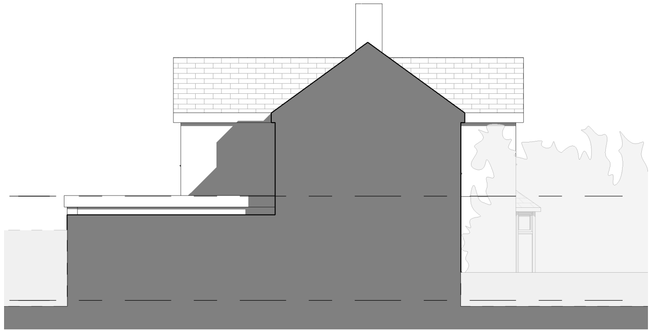
Side Elevation From No31 1 : 100