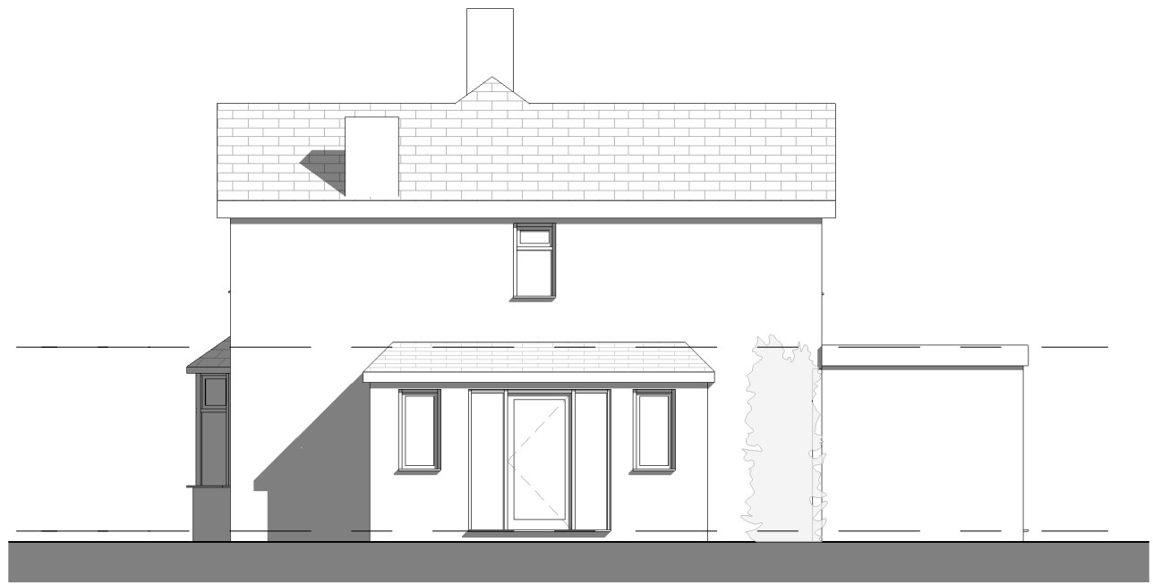
South Side Elevation 1 : 100