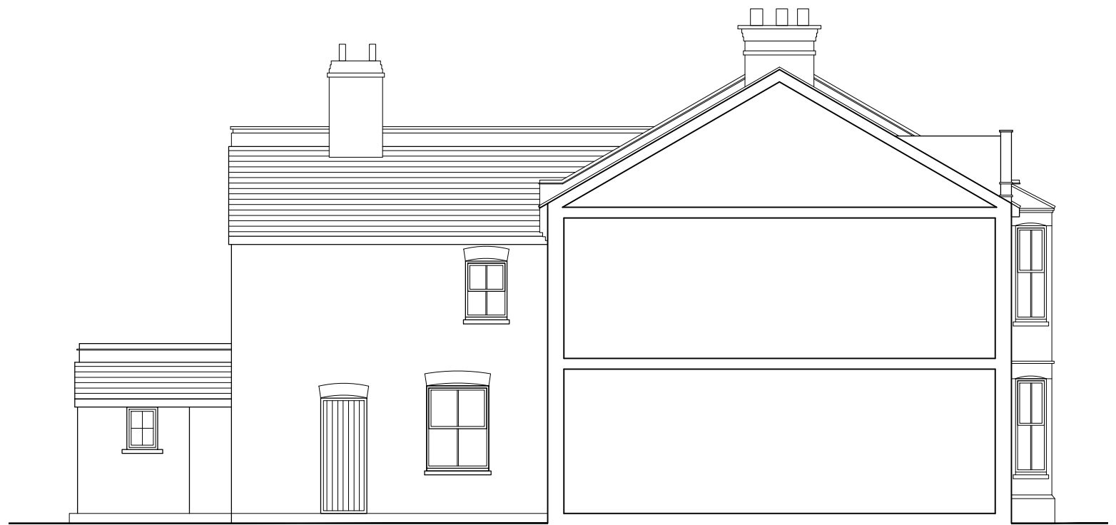
EXISTING (Sectional) ELEVATION