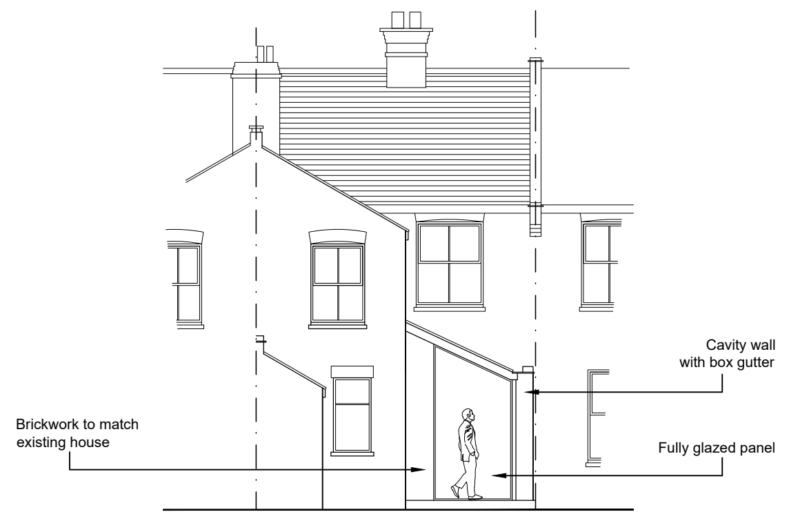
PEOPOSED REAR ELEVATION