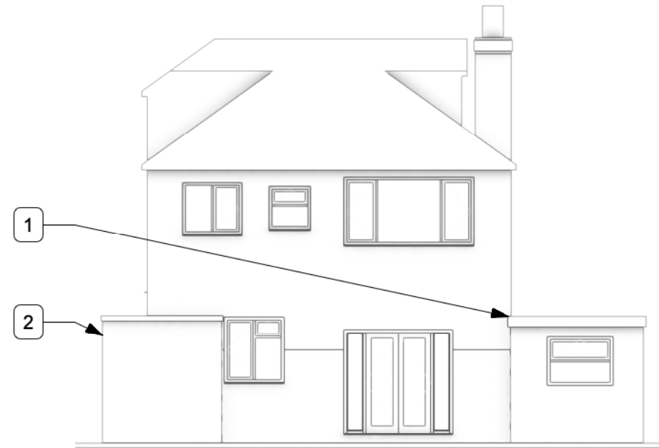
2 East Elevation - Existing Scale: 1:100