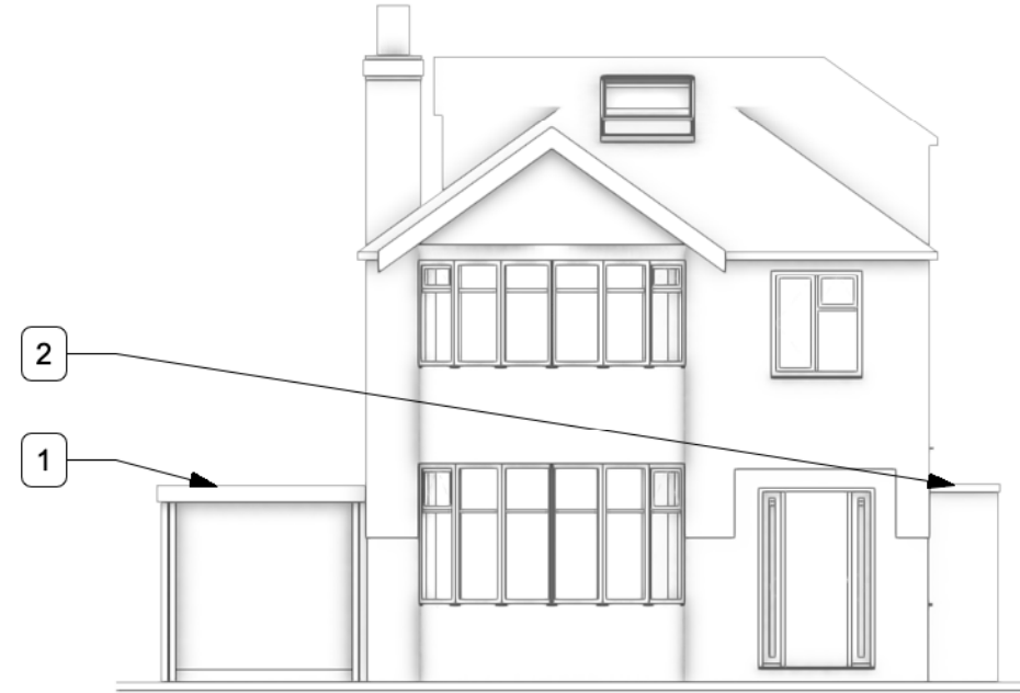
4 West Elevation - Existing Scale: 1:100