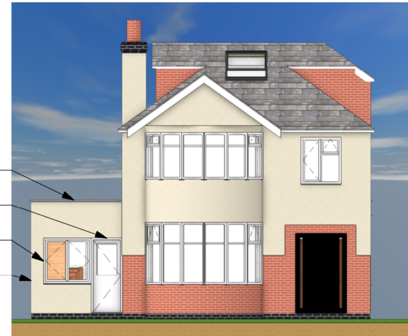
4 West Elevation - Proposed Scale: 1:100