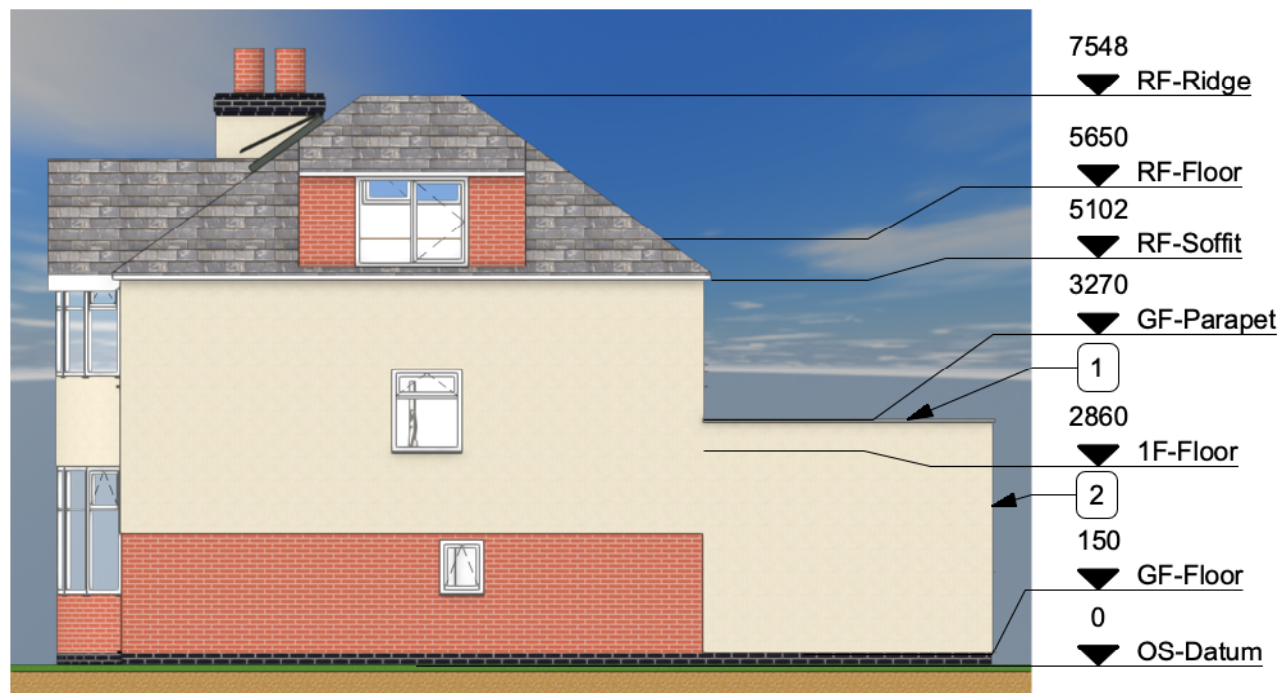
1 South Elevation - Proposed Scale: 1:100