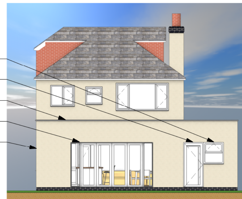
2 East Elevation - Proposed Scale: 1:100