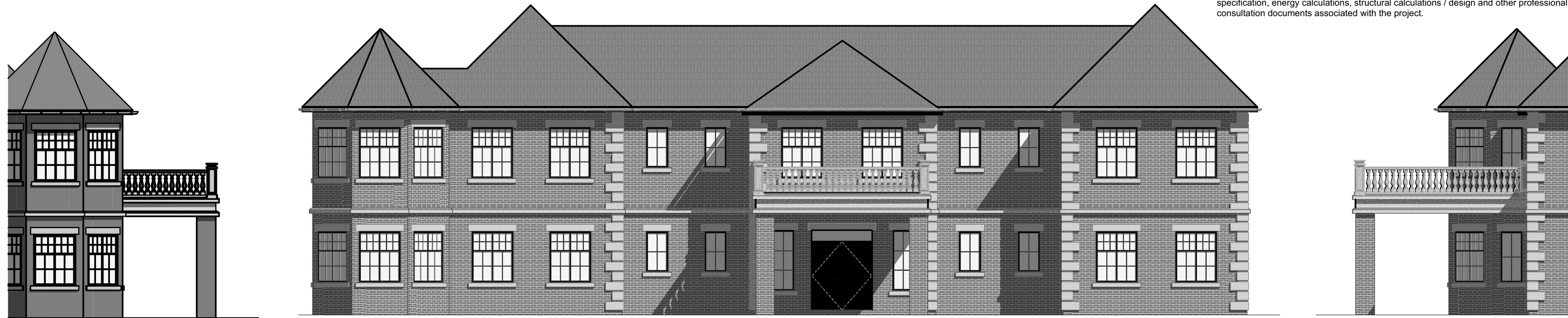
Side Elevation 1:100

CONTACT: SJI Designs Ltd 21 Farnworth Avenue, Rainworth, Mansfield, Notts NG21 0EN steve@sjidesigns.co.uk Tel:- 01623 406877 Mob:- 07512 512 413 www.sjidesigns.co.uk