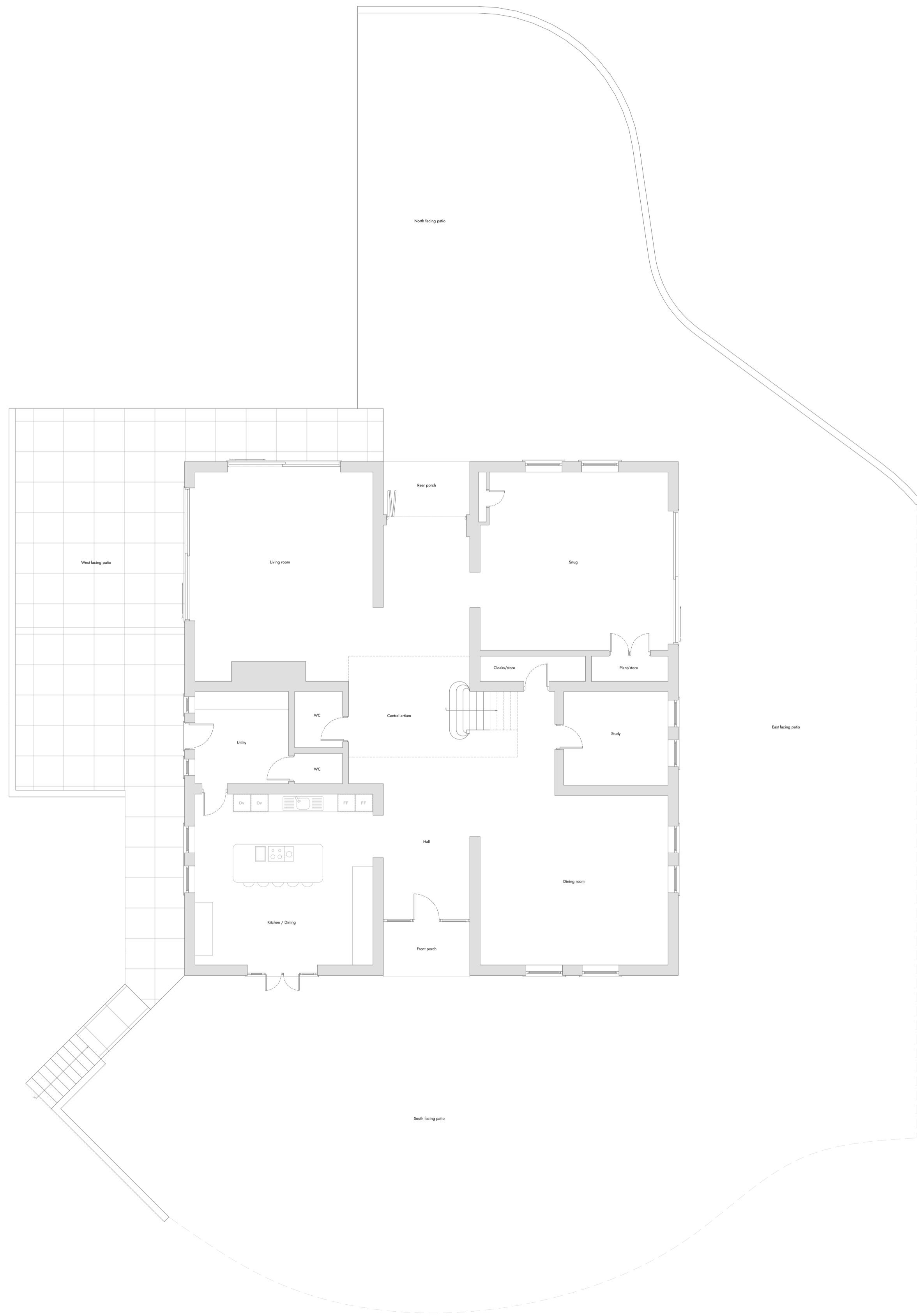
01 Existing ground floor plan 1:100@A1