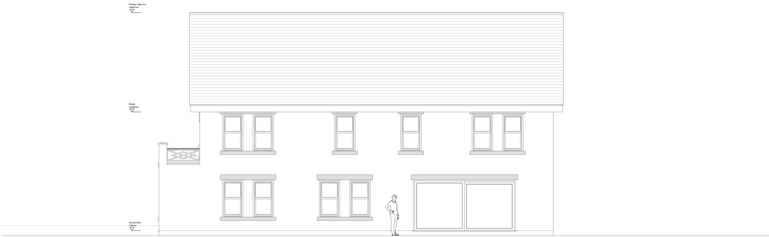
02 Existing side elevation (B) 1:100@A1