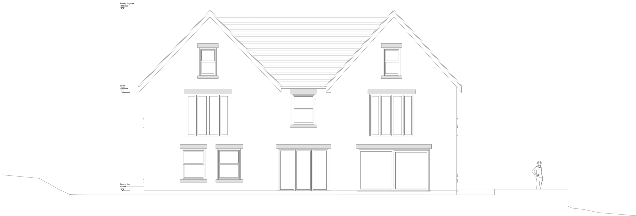
03 Existing rear elevation (C) 1:100@A1