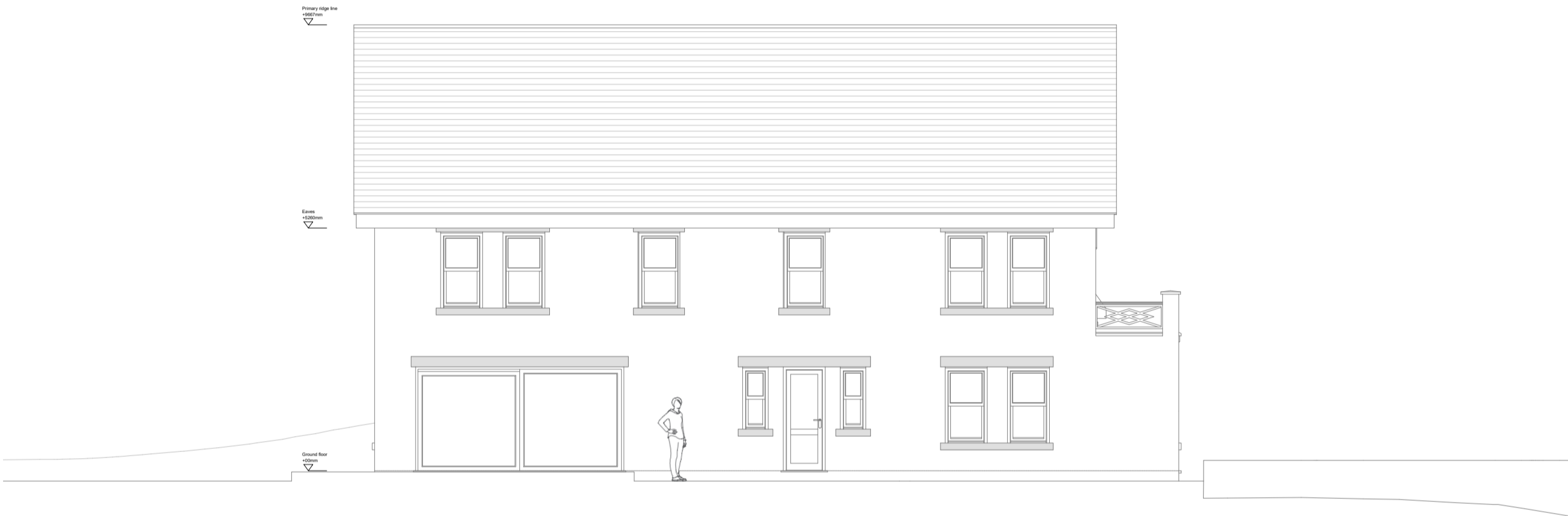
04 Existing side elevation (D) 1:100@A1