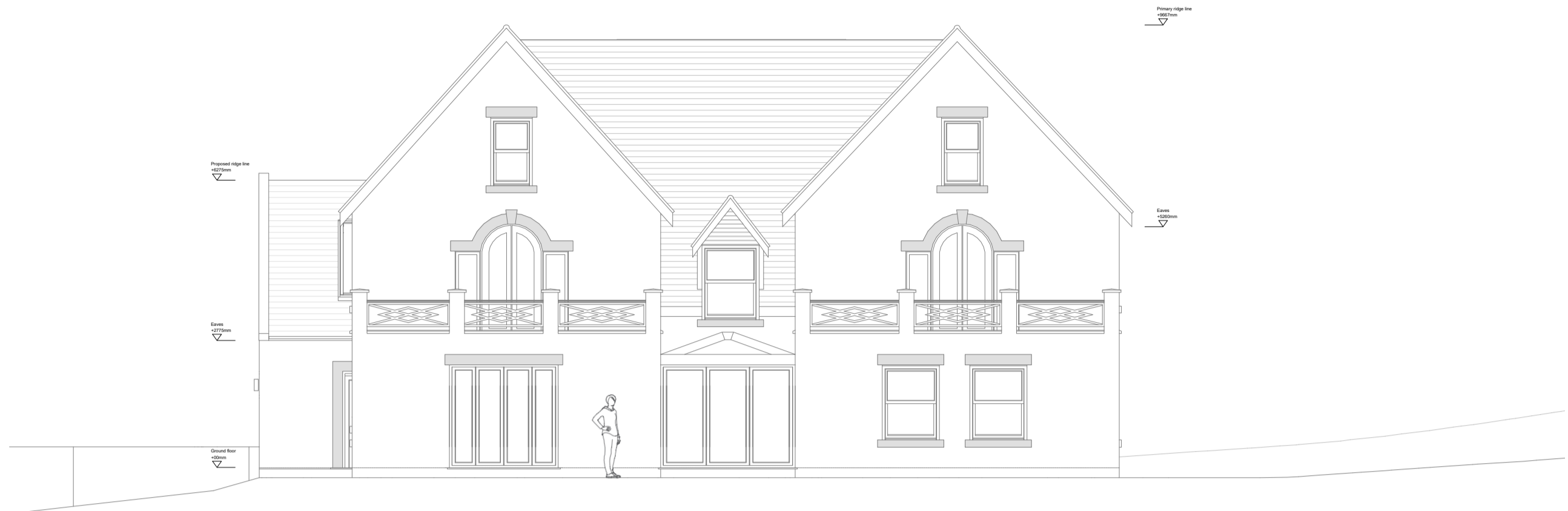
01 Existing front elevation (A) 1:100@A1