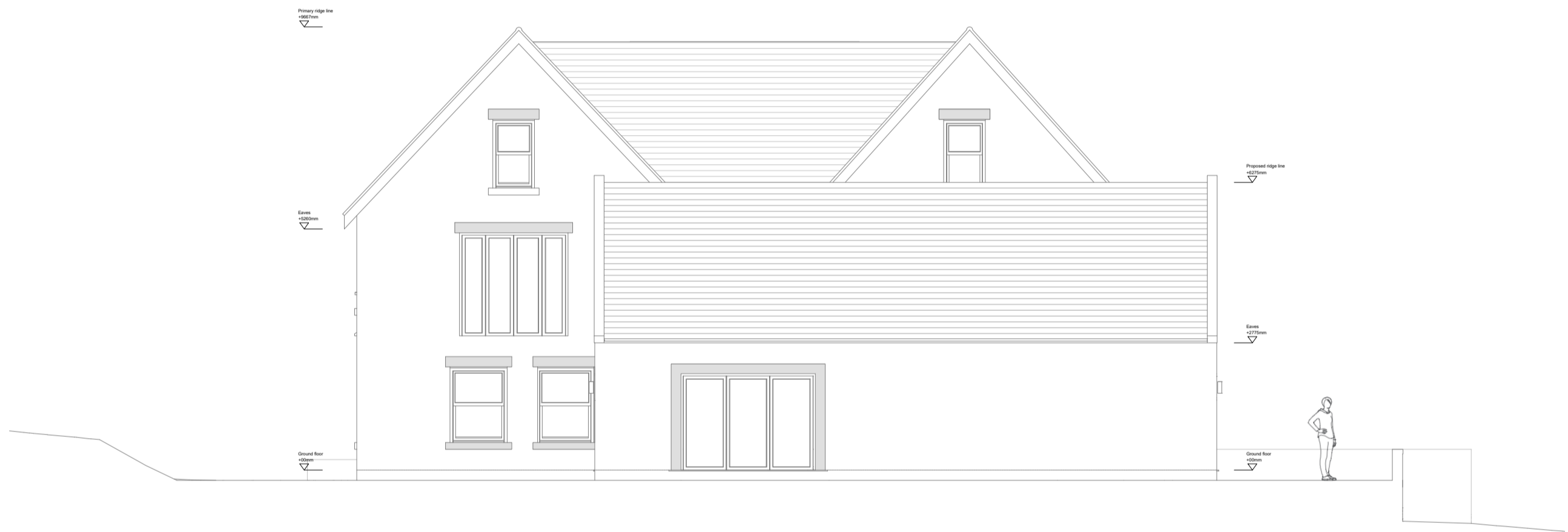
03 Existing rear elevation (C) 1:100@A1