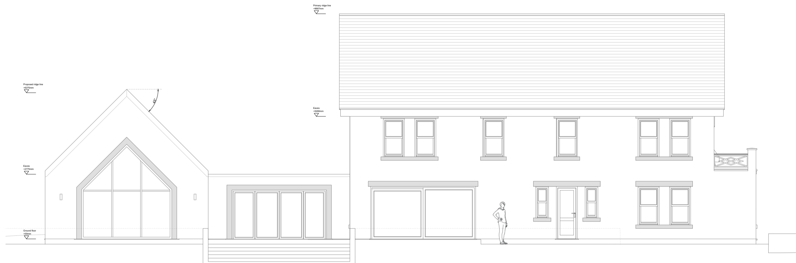
04 Existing side elevation (D) 1:100@A1