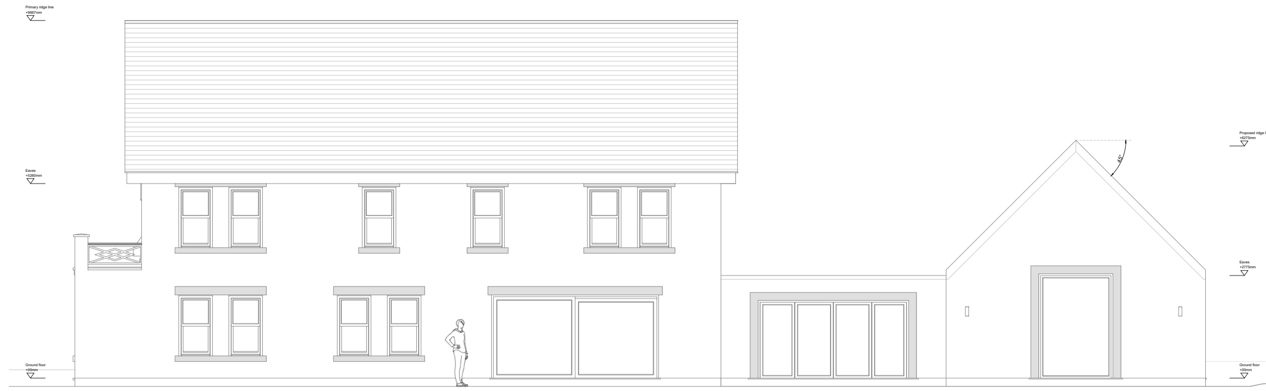
02 Existing side elevation (B) 1:100@A1