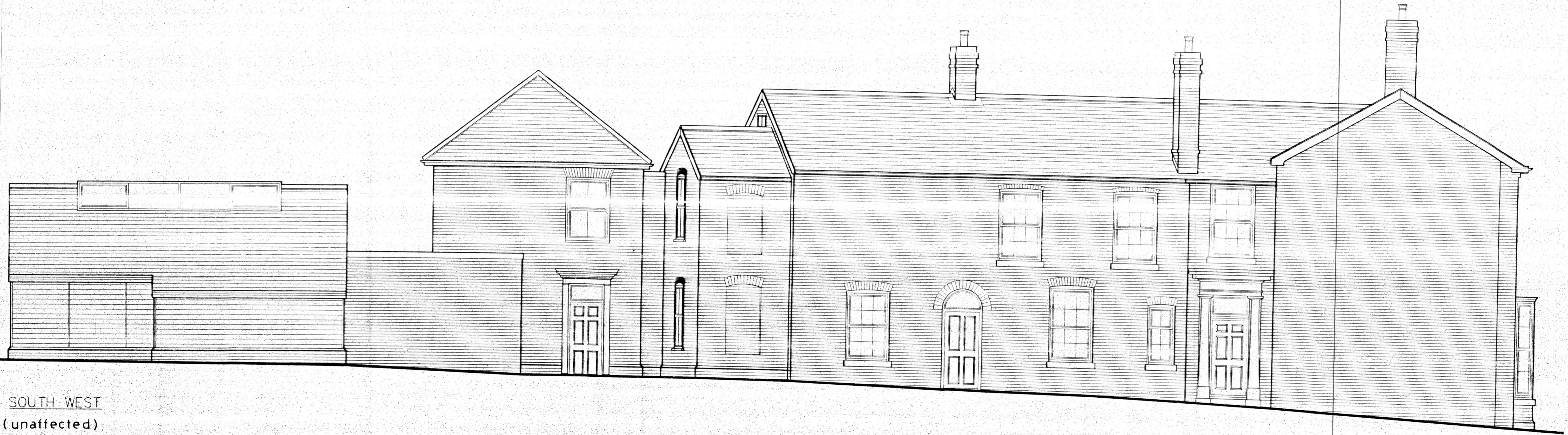
SOUTH WEST (unaffected)