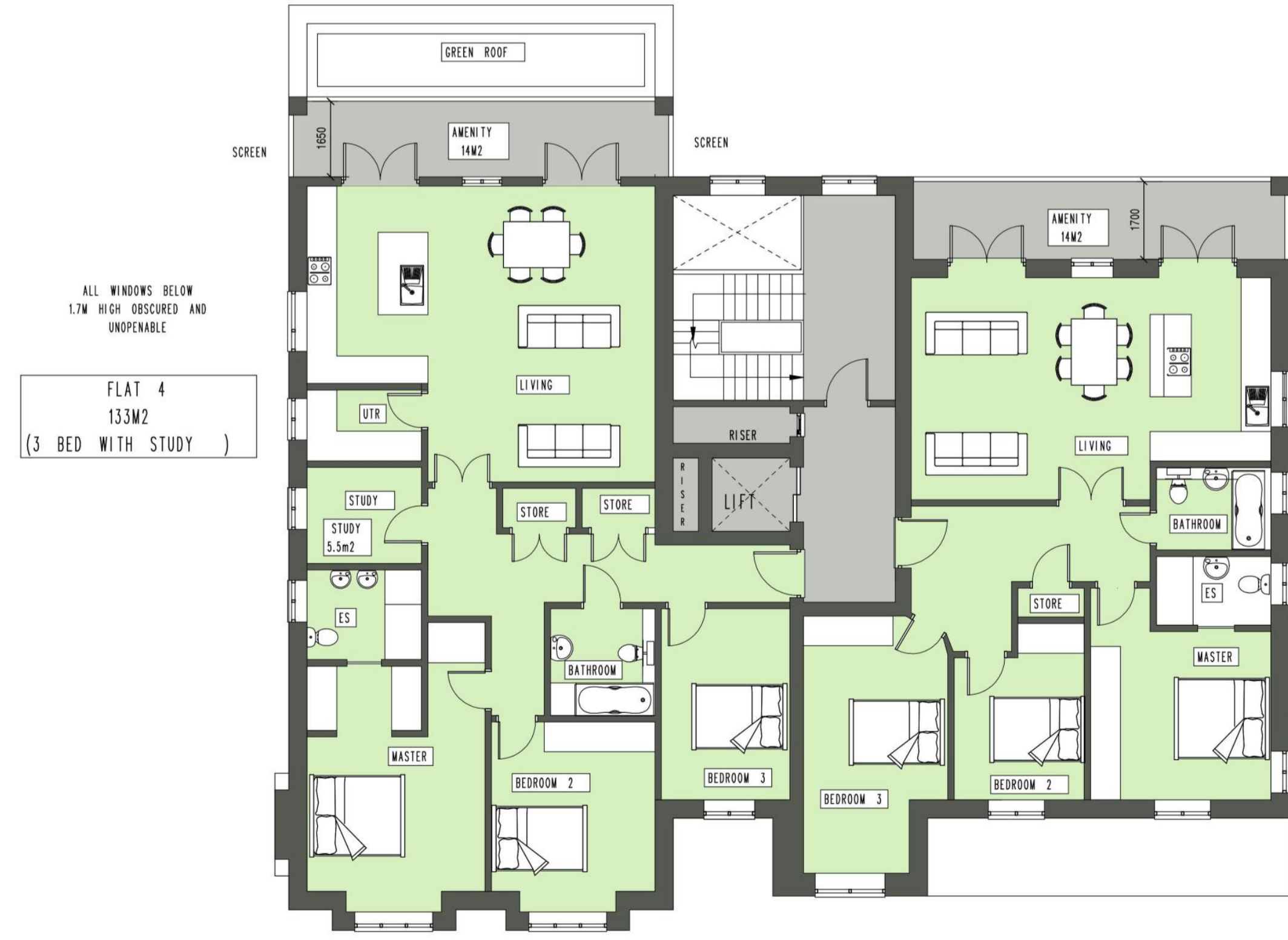
FIRST FLOOR (284M 2 )