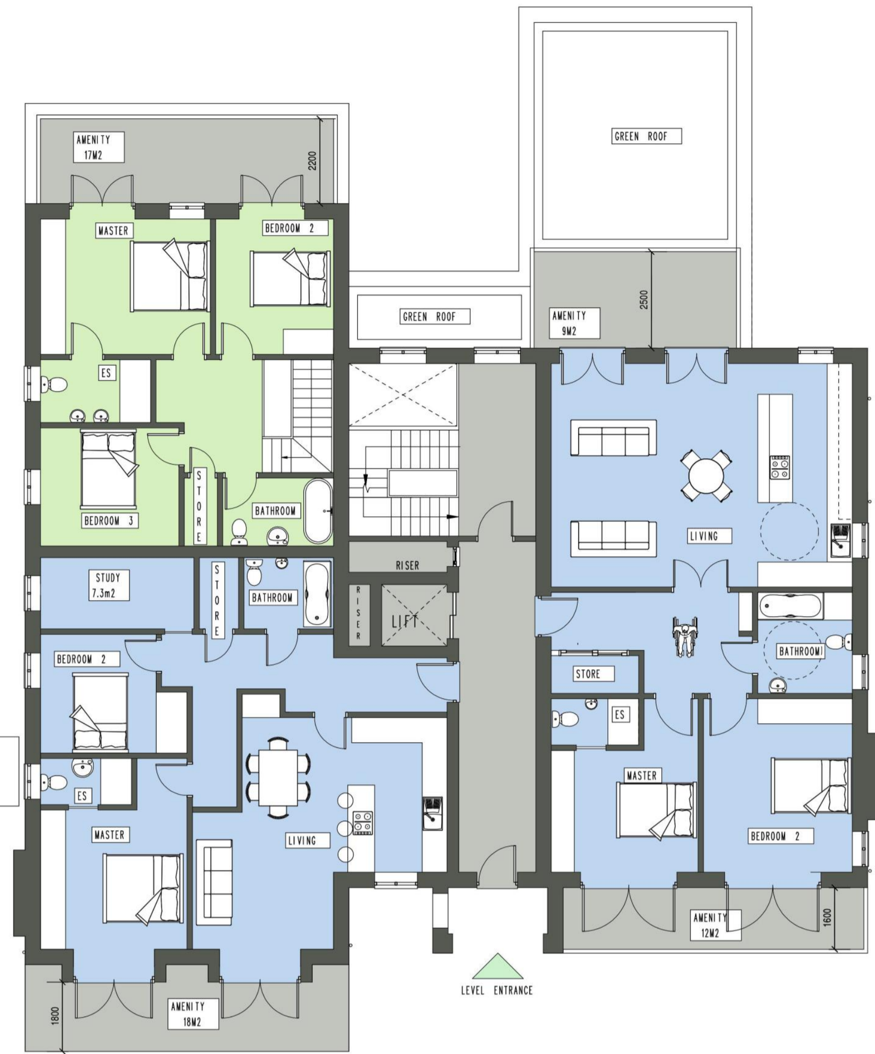
GROUND FLOOR (322M 2 )