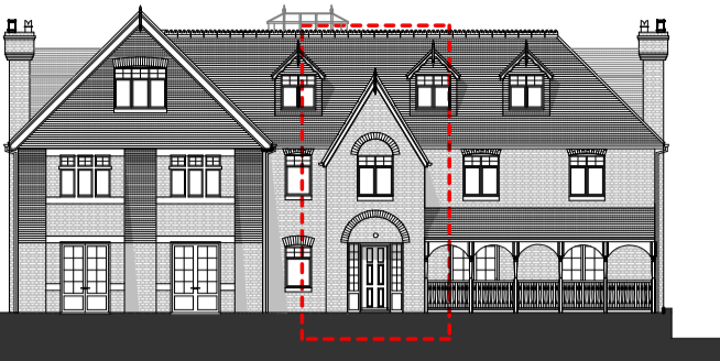
LOCATION OF PART ELEVATION