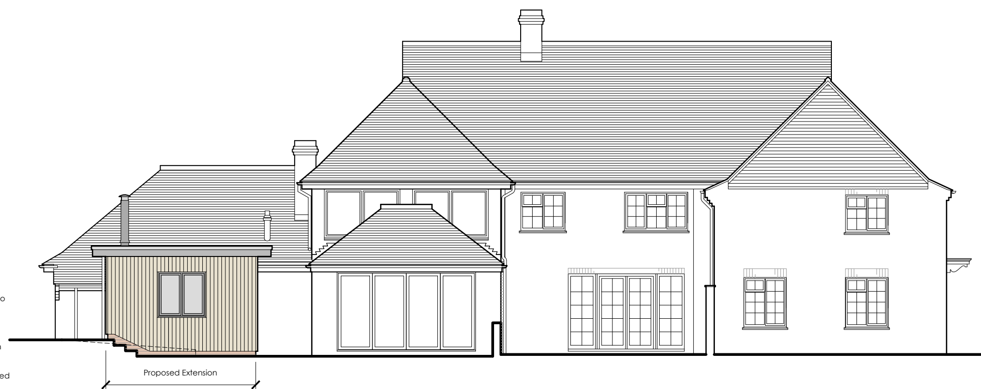
Proposed West Elevation