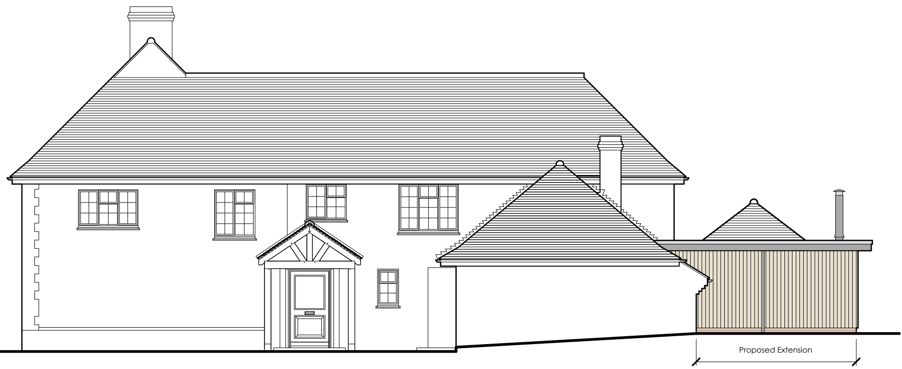
Proposed North Elevation

This drawing is the Copyright of Richard Mazillius and may not be altered or reproduced in any way without written permission of Richard Mazillius. Written dimensions supersede scaled dimensions. All dimensions to be checked on site by the Contractor before commencement of the works or before components are fabricated. This drawing is to be used only for the purposes intended and as described in the drawing title box. This drawing to be read in conjunction with all other project drawings, including other appointed Consultant drawings as applicable to the project.