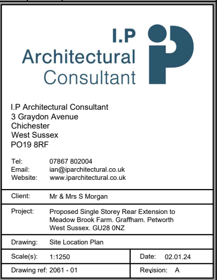
Site Location Plan 1:1250