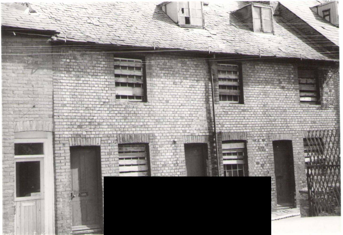
Photograph circa 1970(?) of nos 2, 3 and 4 Castle Banks (together, present 4 Castle Banks), front, showing original dormers with divided lights