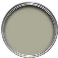
Painted Timber. Factory sprayed paint finished, Colour: French Grey