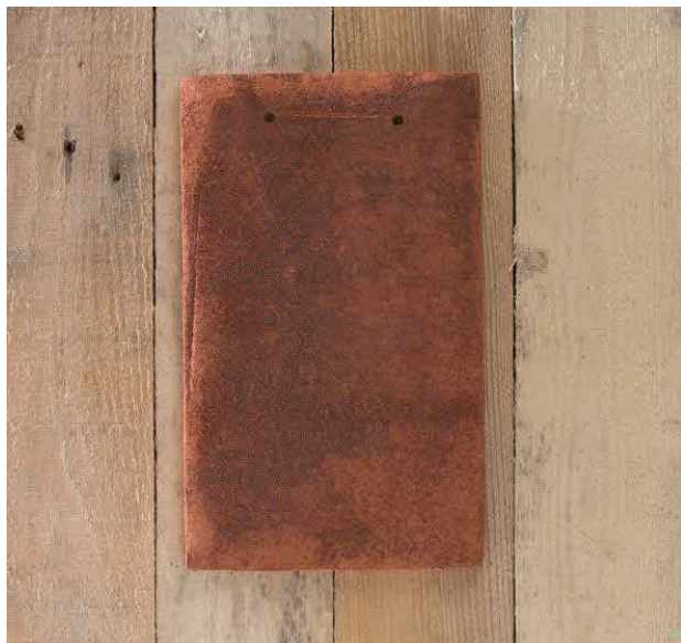
Keymer Traditional Handmade Clay Tile – Antique Finish