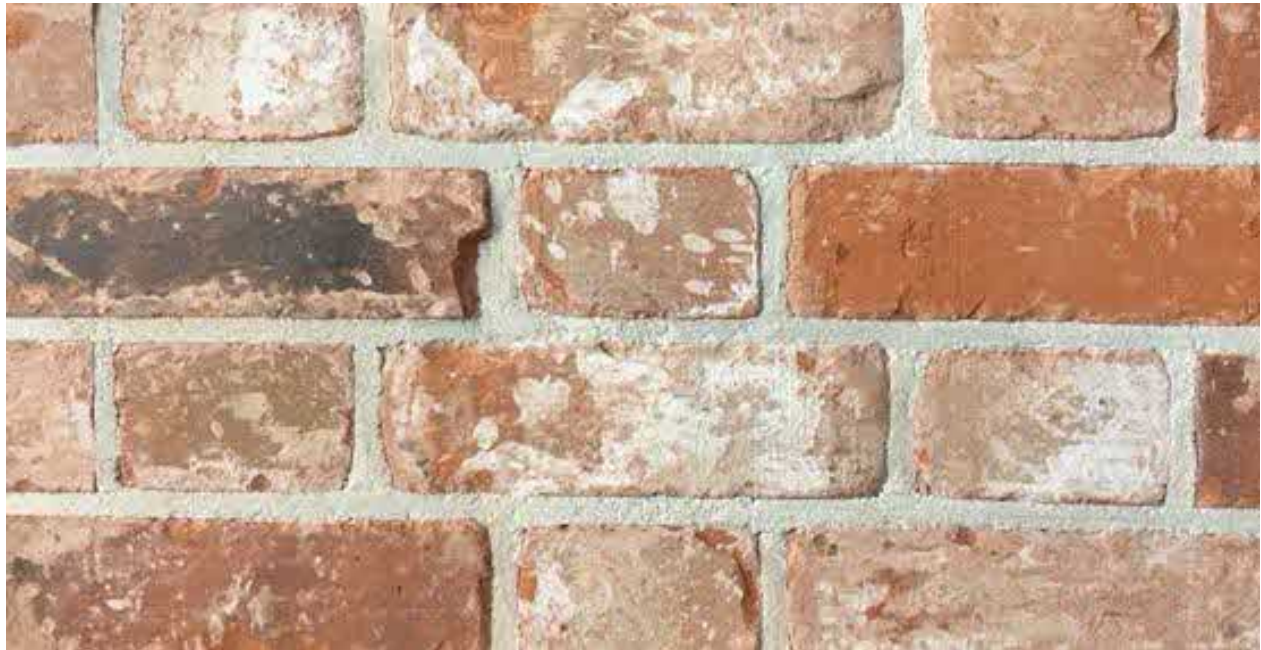
Avorio by The Bespoke Brick Company .