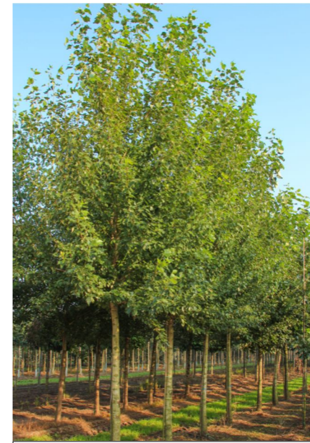
Populus x berolinensis