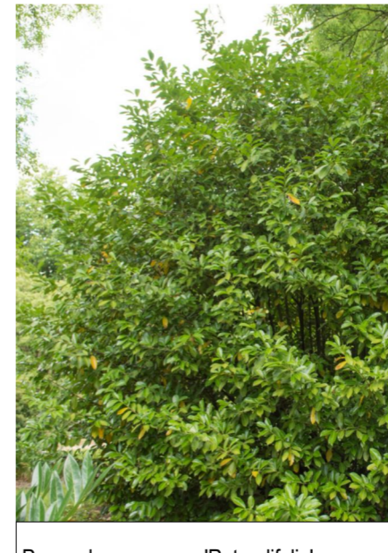
Prunus laurocerasus 'Rotundifolia'