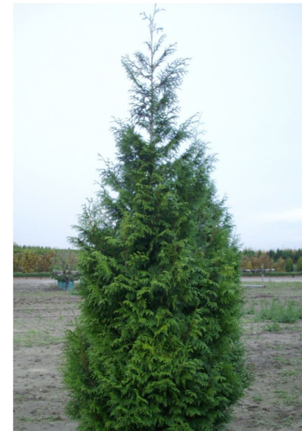
Thuja plicata 'Gelderland'