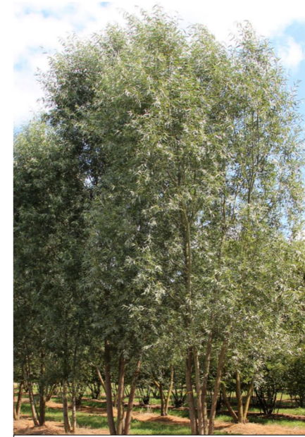
Salix alba Chermesina