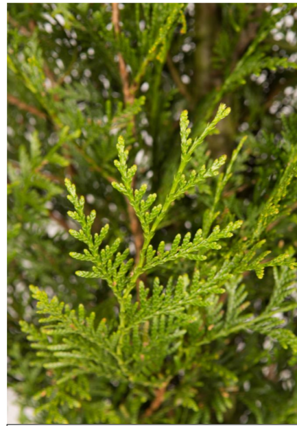
Thuja plicata 'Atrovirens'