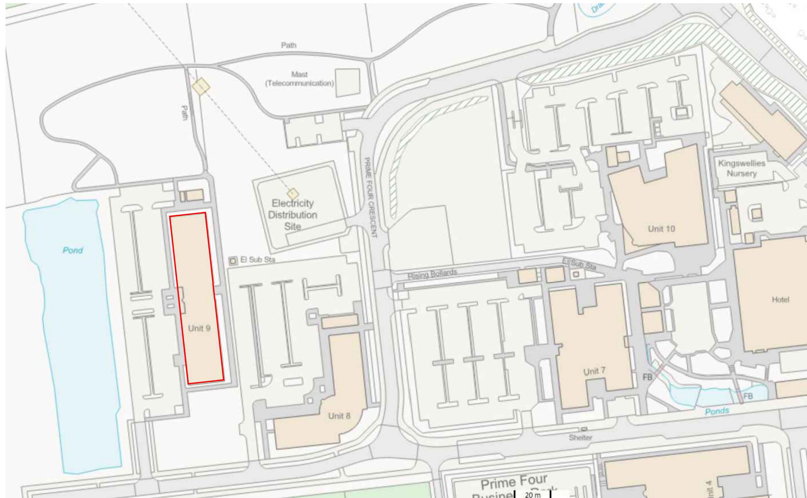
PROPOSED LOCATION PLAN Scale 1:100