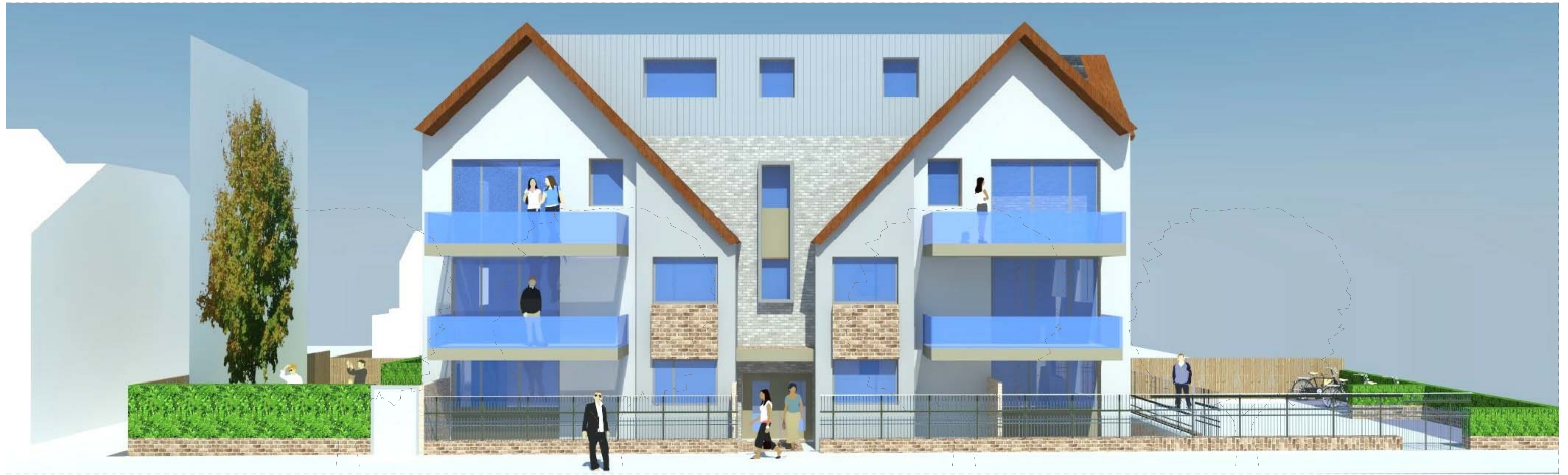
145 GOLDERS GREEN ROAD PROPOSED ELEVATION 1 showing street trees (facing gainsborough gardens)