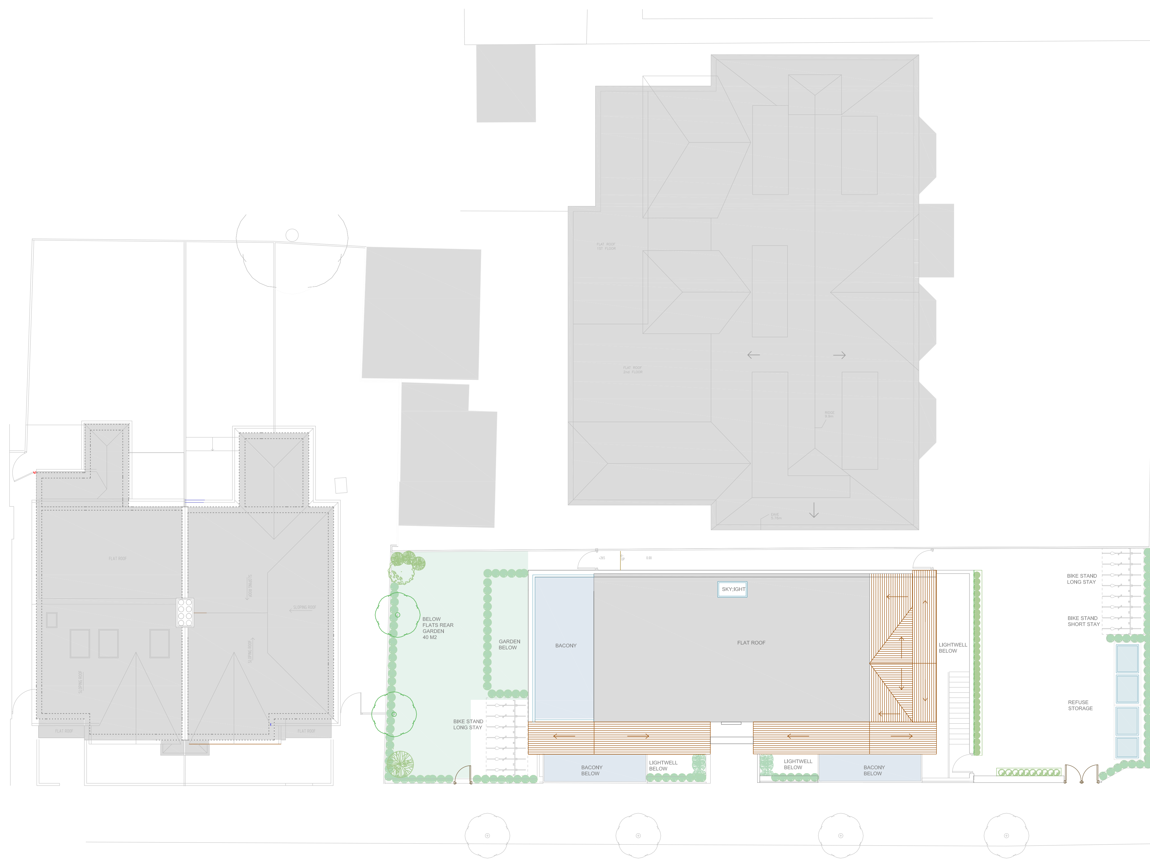
2952 PROPOSED ROOF