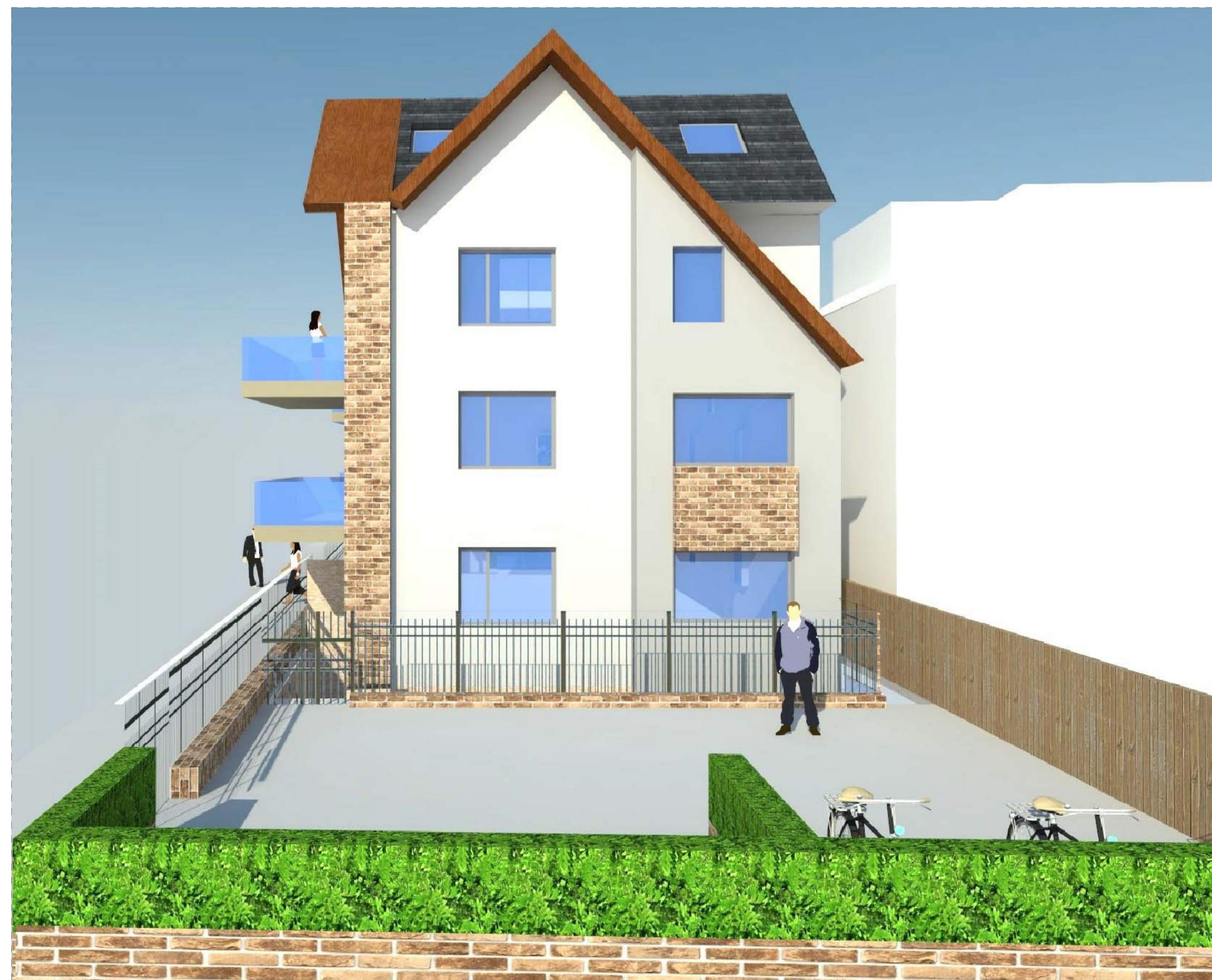
145 GOLDERS GREEN ROAD PROPOSED ELEVATION (facing Golders Green Road)