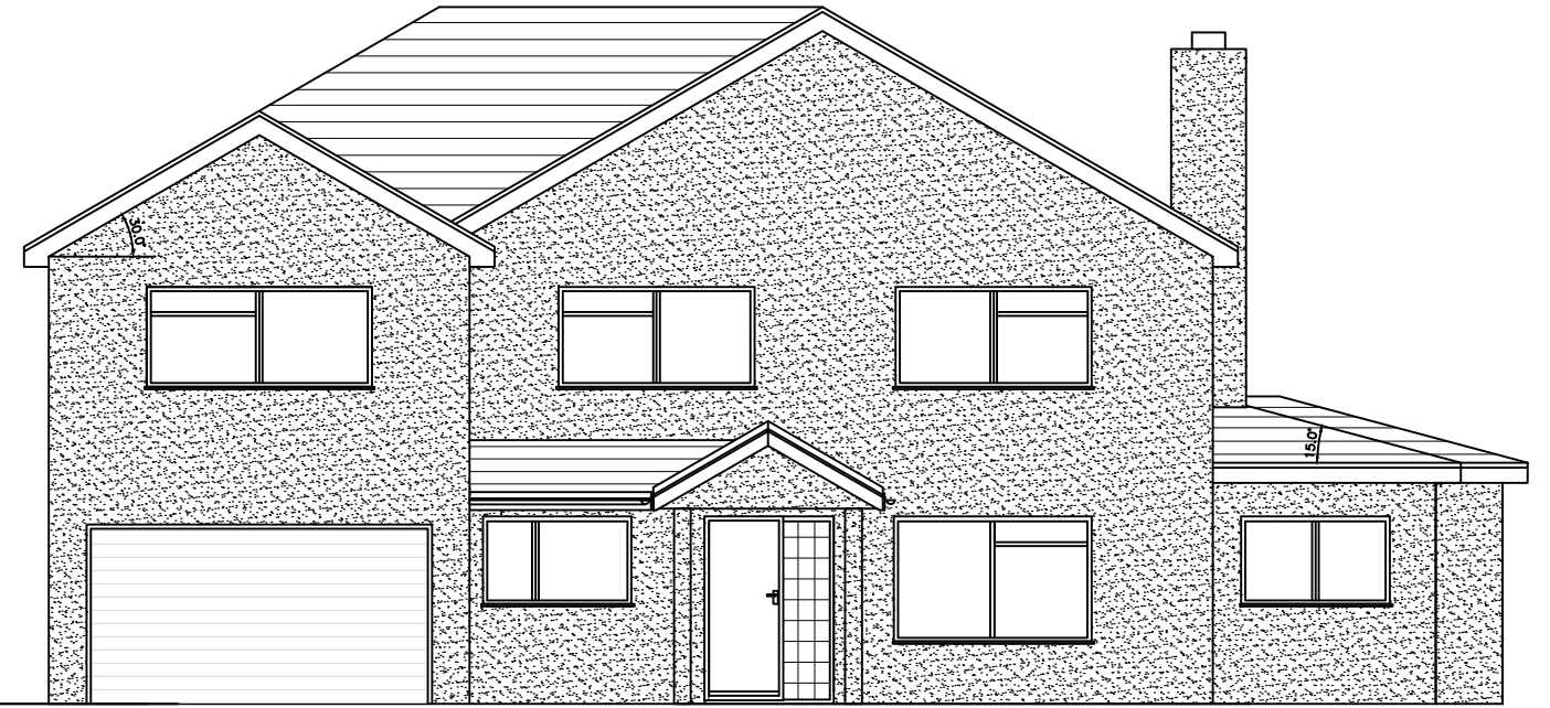
Proposed Front Elevation, 1:100