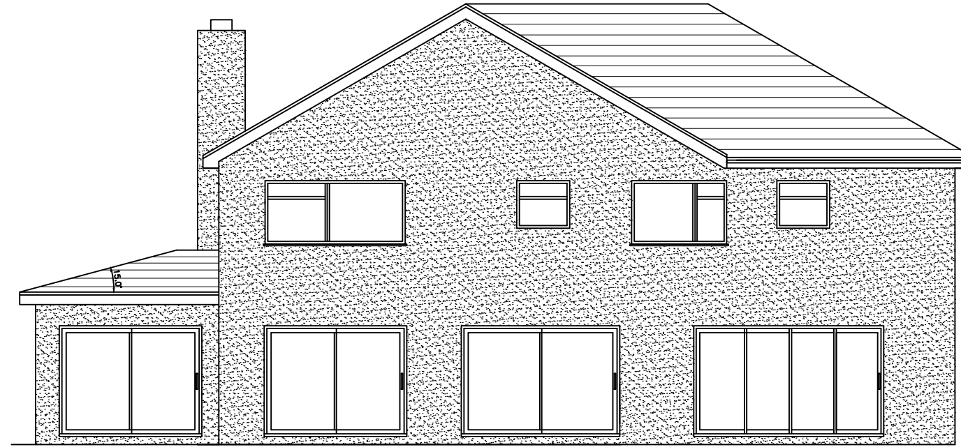
Proposed Rear Elevation, 1:100

NOTES All setting out Dimensions and Levels, Tanking, Services, Damp Proof Membranes etc. to be determined on site. All dimensions are to finishes.