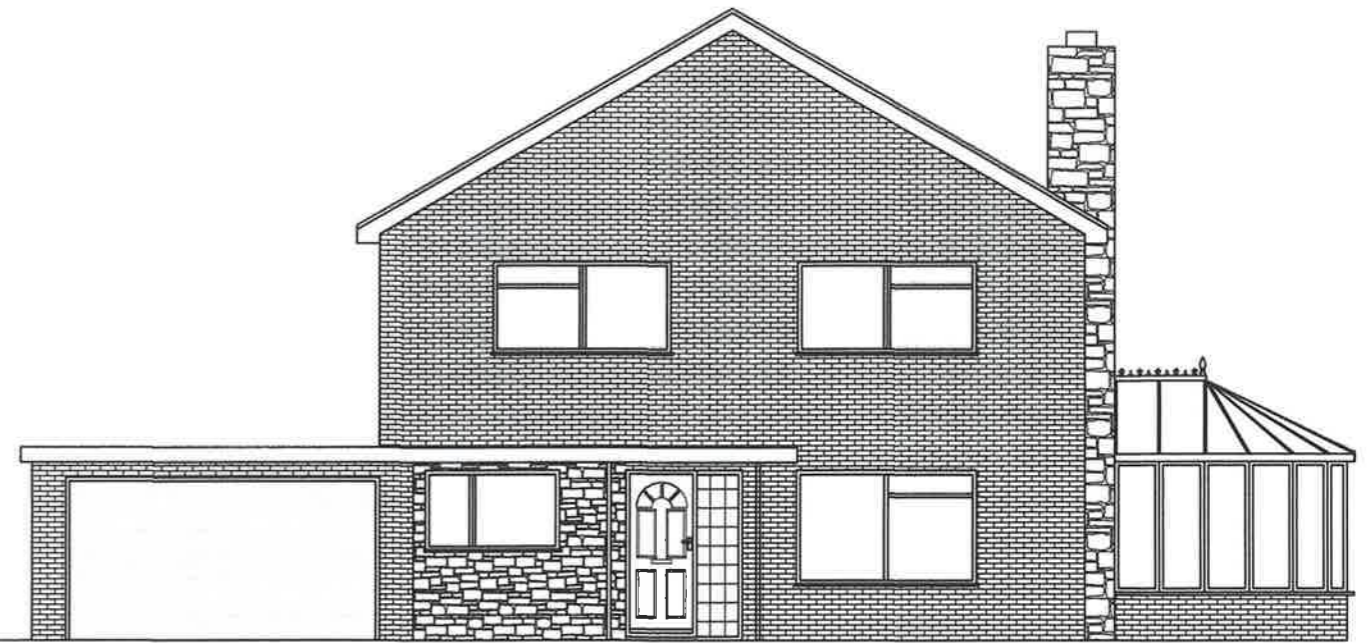
Existing Front Elevation, 1:100