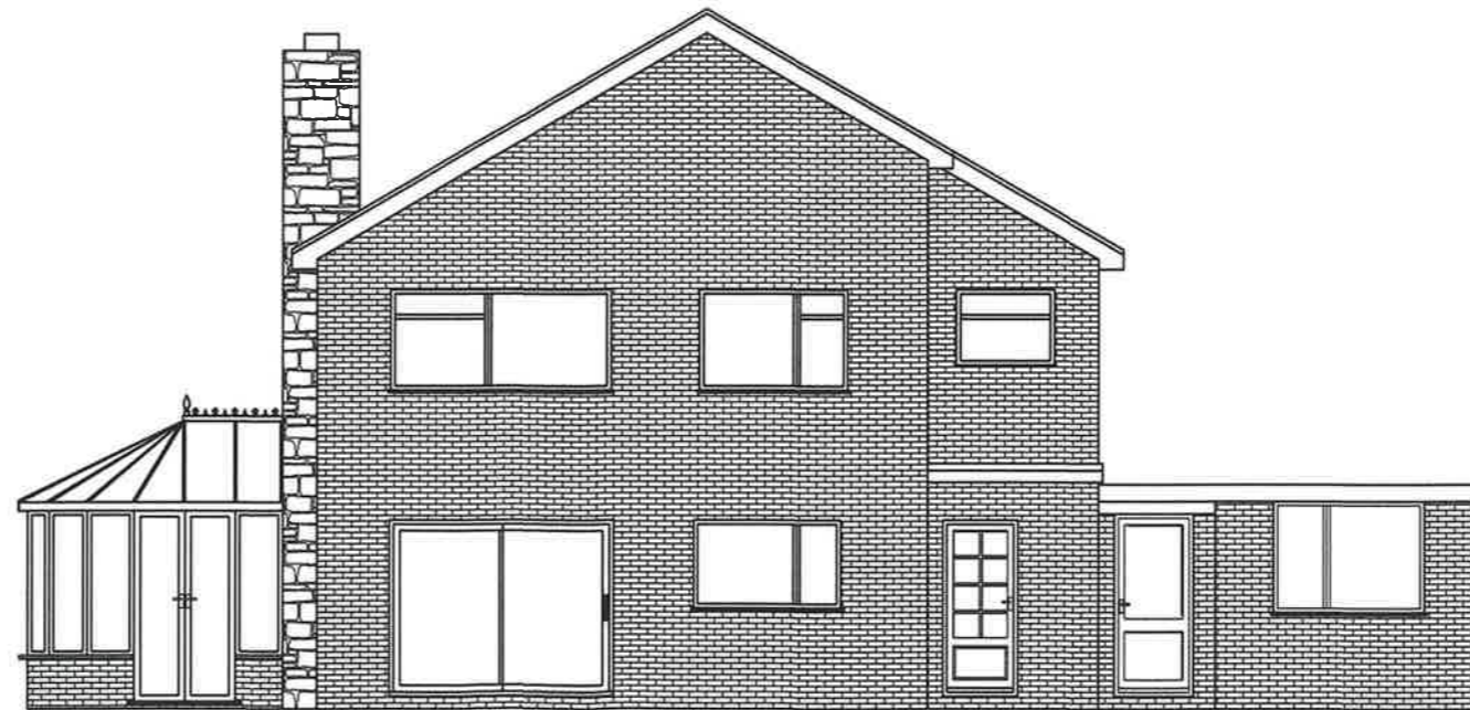
Existing Rear Elevation, 1:100