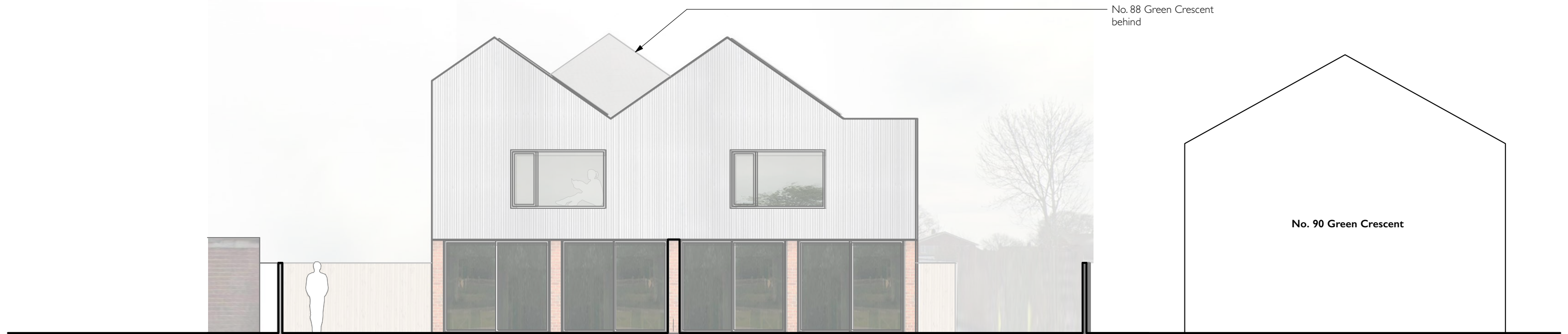
Proposed West Elevation 1:100 @ A3