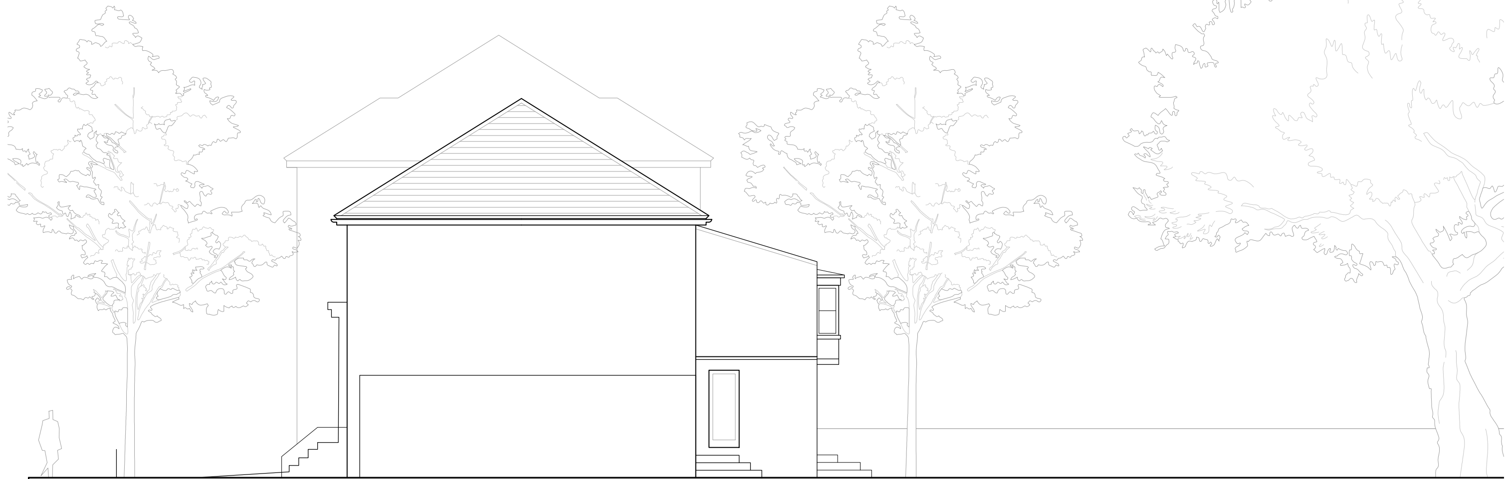
EXISTING SOUTH-WEST ELEVATION E-E

NOTE: Do not scale (apart from when issued for Planning Application purposes). Figured dimensions only to be taken from this drawing. Dimensions are shown in millimeters unless noted otherwise. Check dimensions on site and report discrepancies to the Architect or Contract Administrator. Not to be used for Construction purposes unless stated. This drawing is protected by copyright and may not be reproduced without the Architect's written permission. The design is site specific and may not be reproduced on any other site without the Architect's written permission. All areas have been measured from current drawings. They may vary because of (eg) survey, design development, construction tolerances, statutory requirements or re-definition of the areas to be measured. This drawing is to be read in conjunction with all relevant details and other consultants information for the project