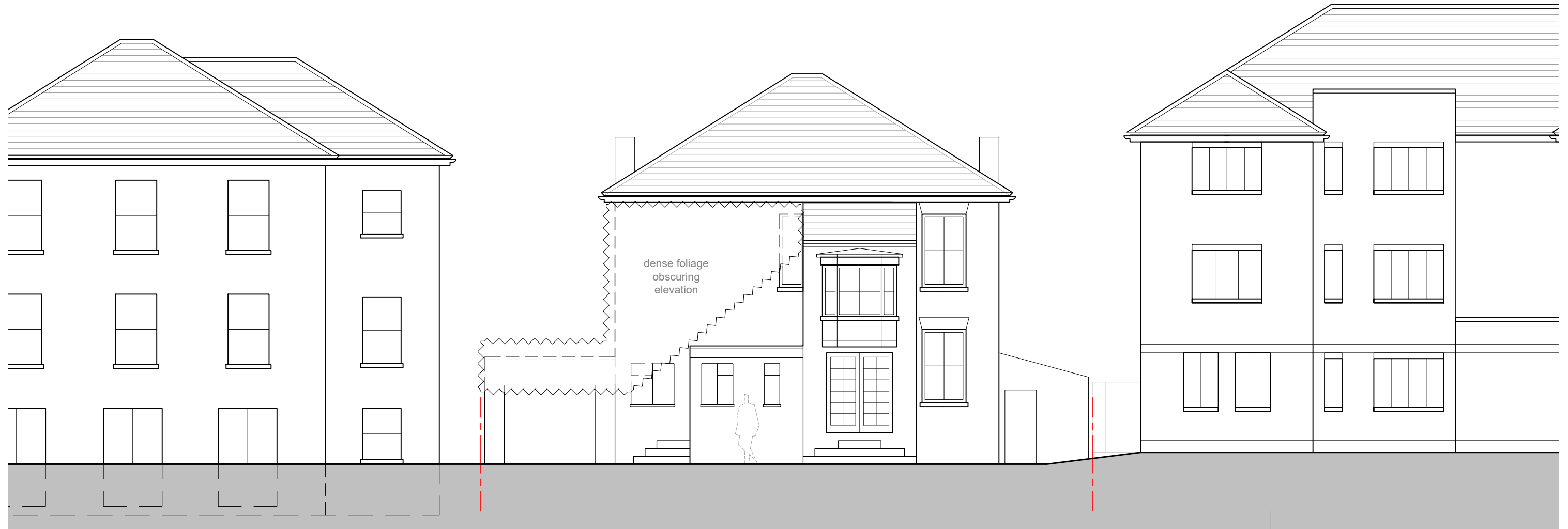
EXISTING NORTH-EAST ELEVATION C-C