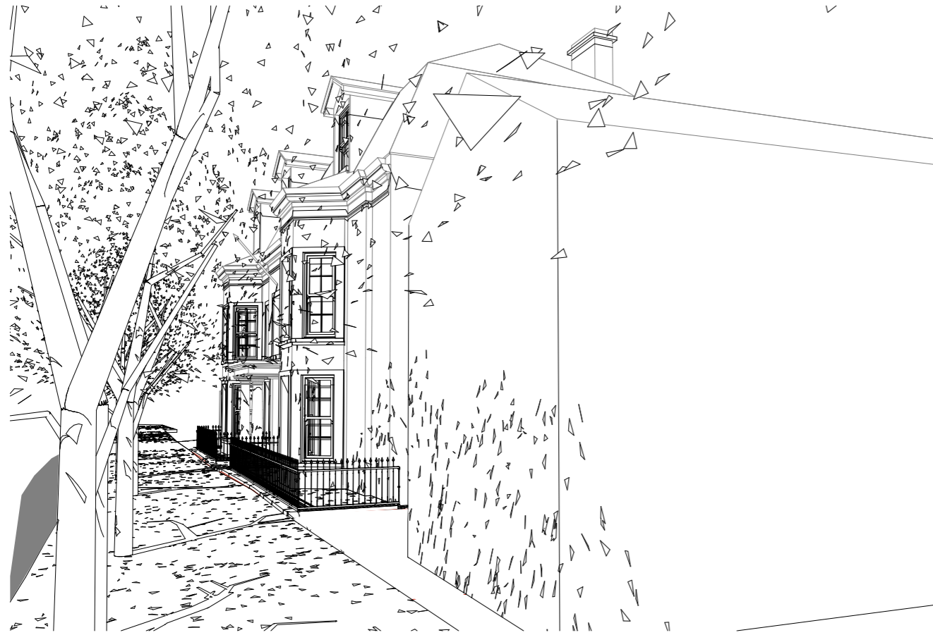
View 1 - Proposed