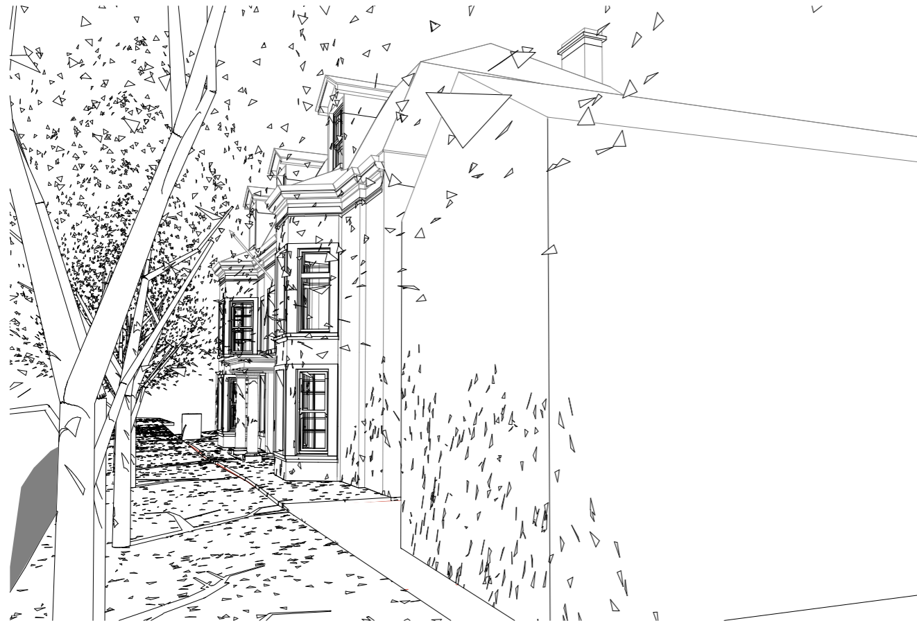
View 1 - Existing