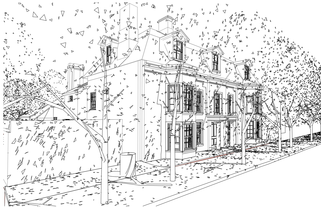
View 2 - Existing

For Planning purposes only. If in doubt ASK!