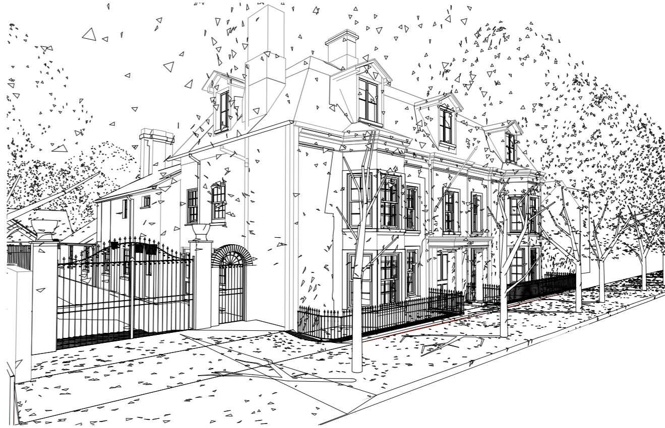
View 2 - Proposed