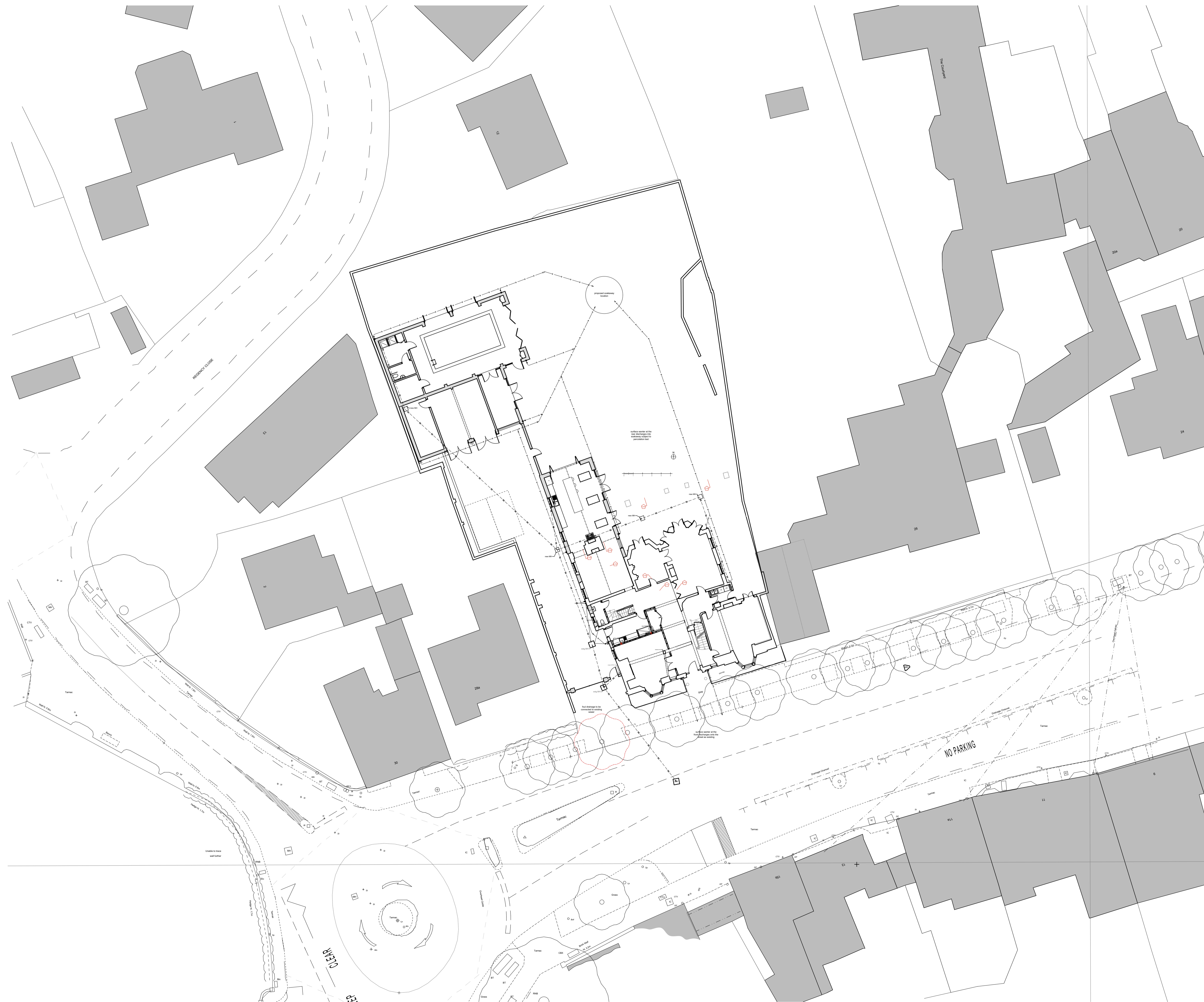
Drainage Strategy Plan - Proposed 1:200

For Planning purposes only. If in doubt ASK!