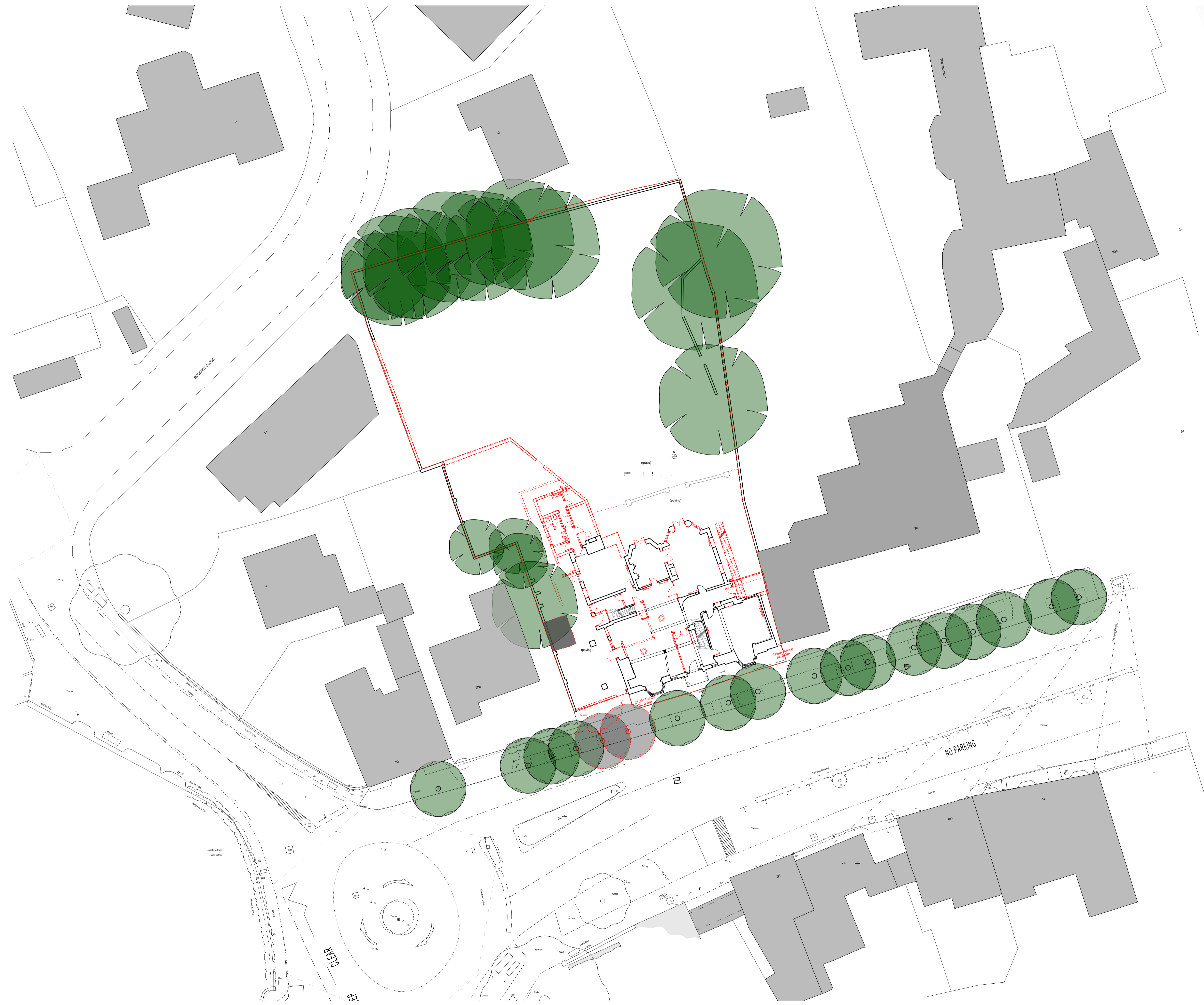
Site Plan - Demolition 1:200

For Planning purposes only. If in doubt ASK!