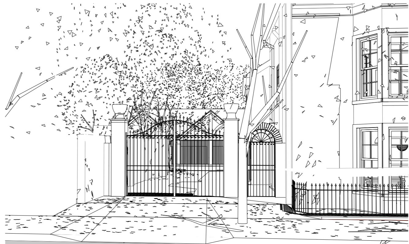
View 8 - Proposed

For Planning purposes only. If in doubt ASK!