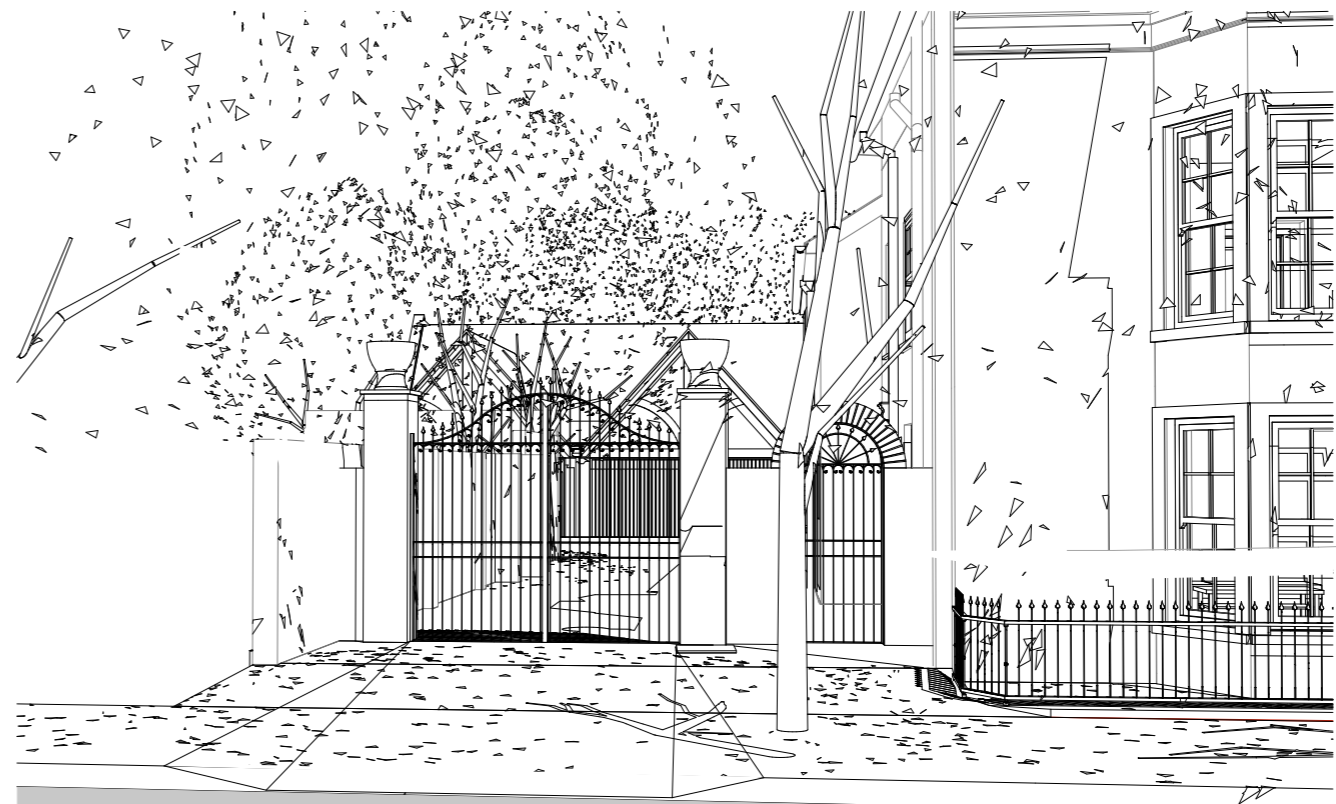
View 8 - Proposed

For Planning purposes only. If in doubt ASK!