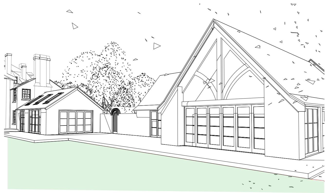
View 6 - Proposed