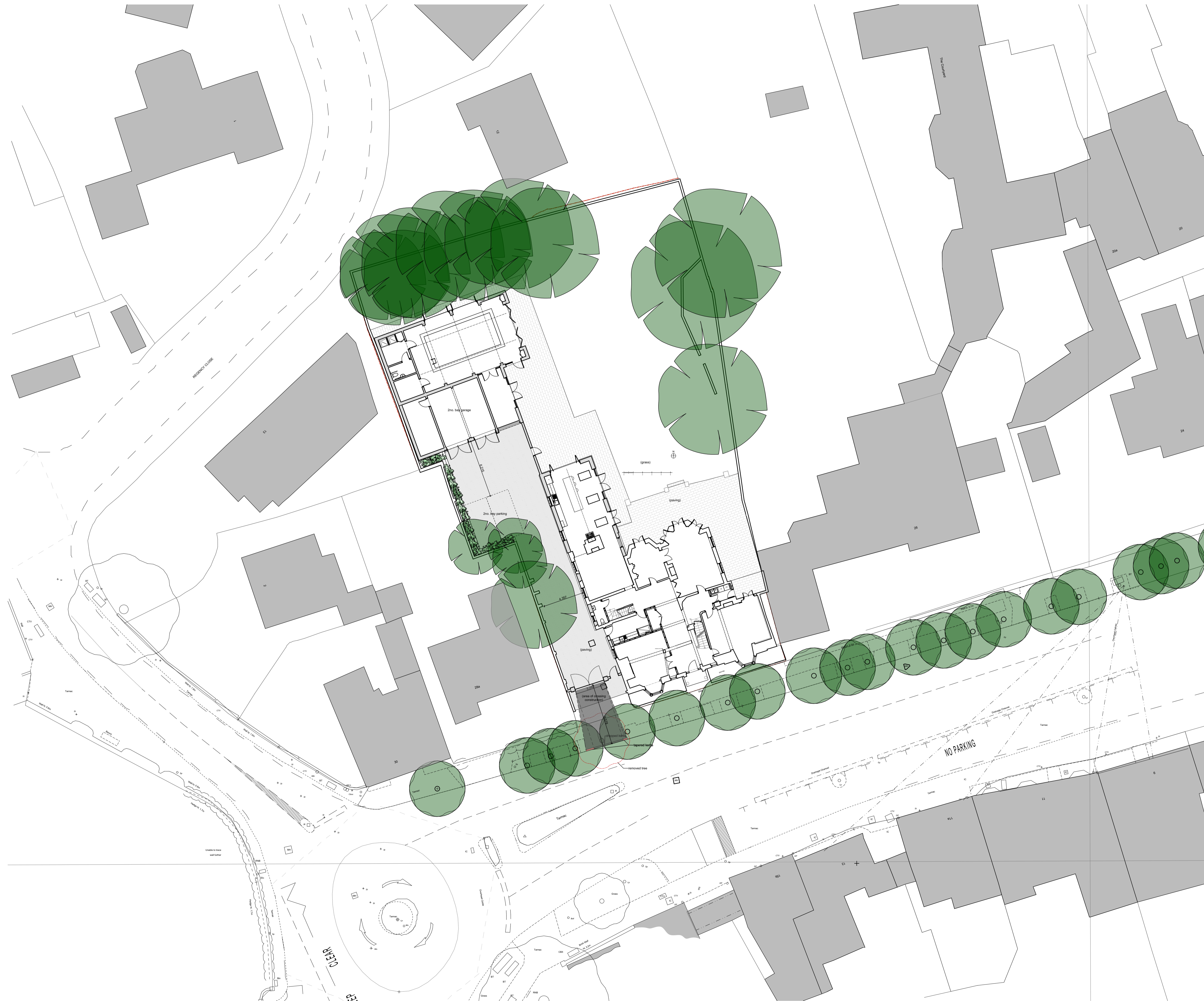
Site Plan - Proposed 1:200

For Planning purposes only. If in doubt ASK!