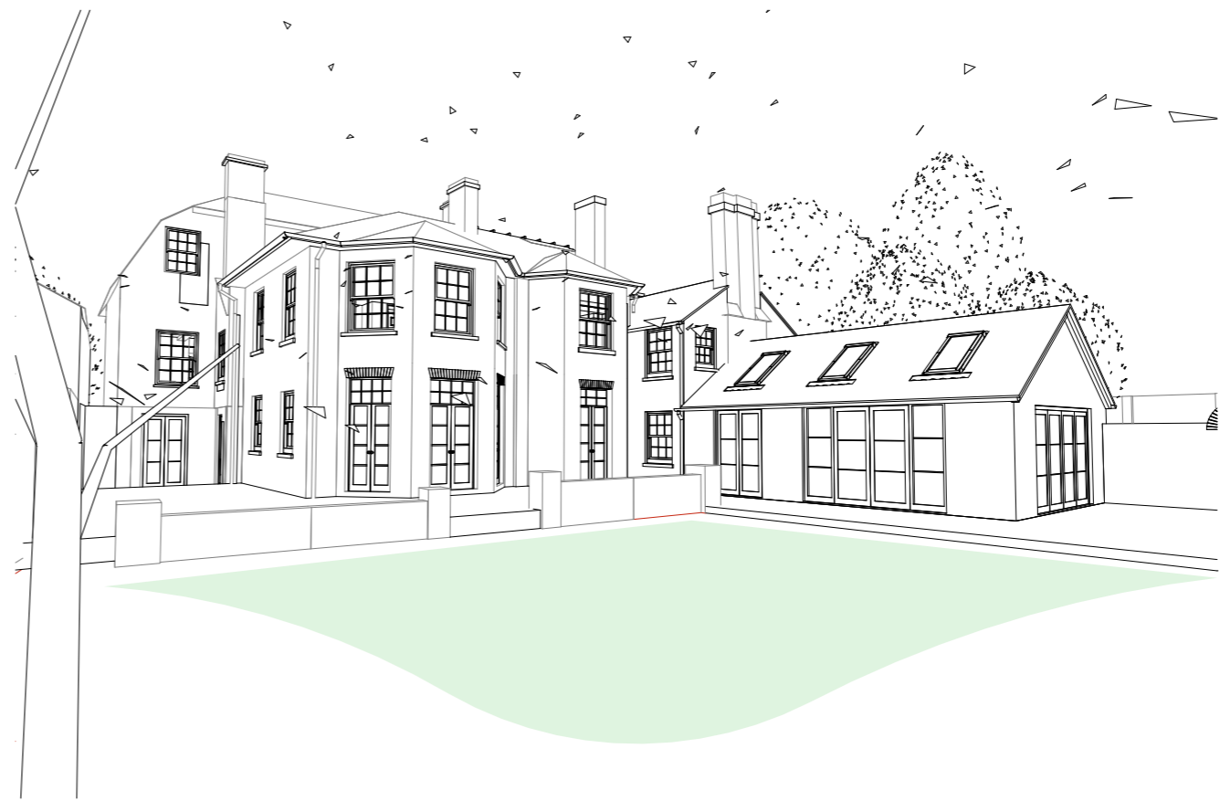
View 4 - Proposed