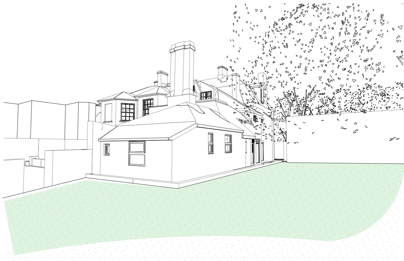
View 3 - Existing