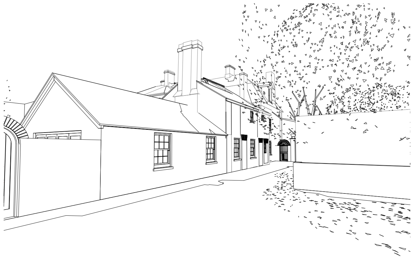
View 3 - Proposed