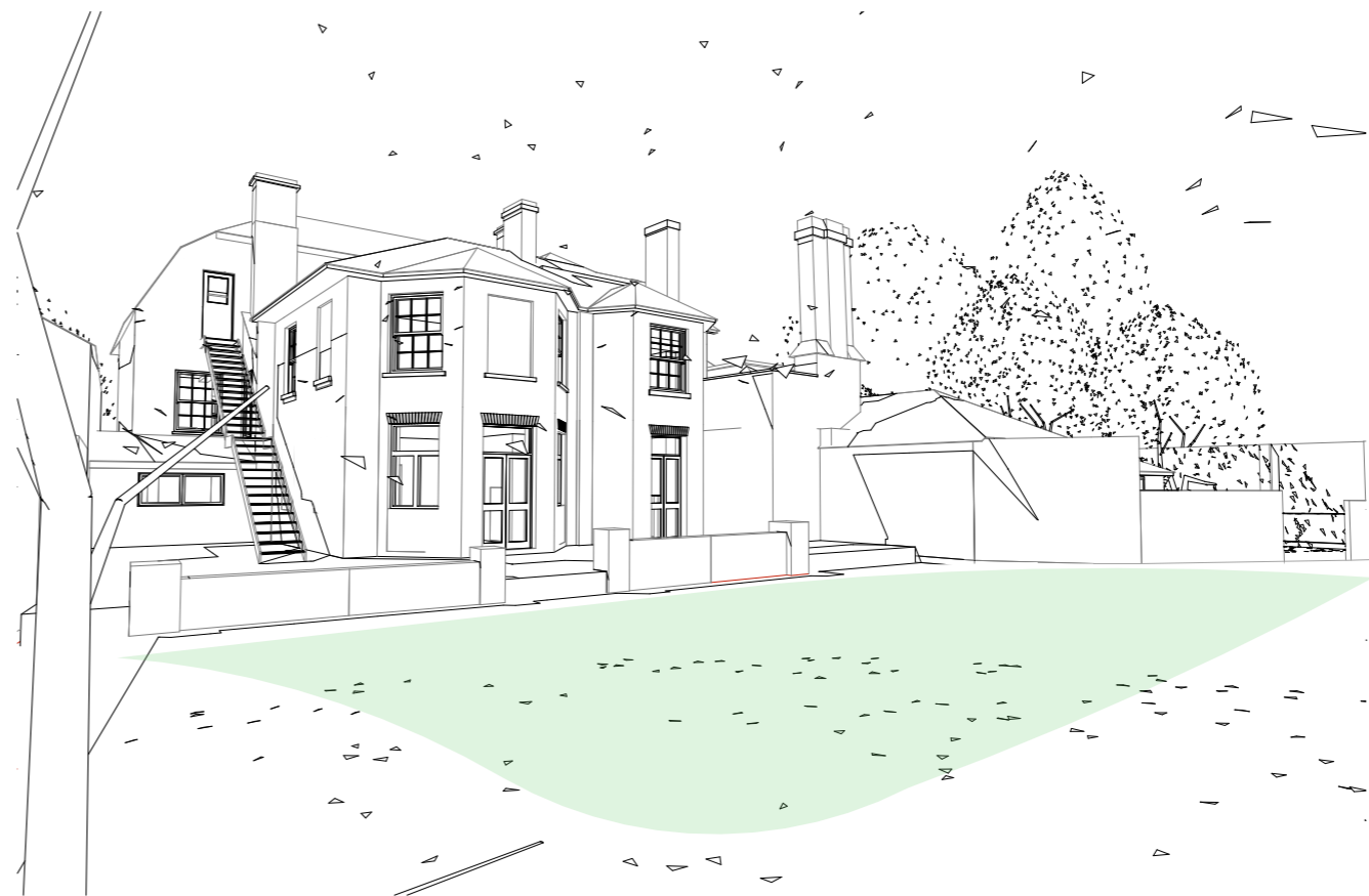
View 4 - Existing

For Planning purposes only. If in doubt ASK!