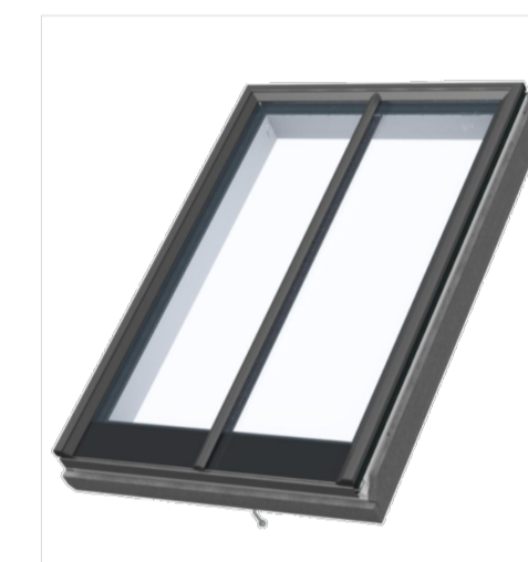
D CONSERVATION ROOF LIGHTS