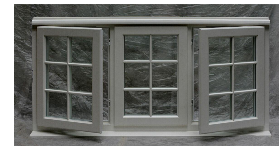
D PAINTED TIMBER CASEMENT WINDOW