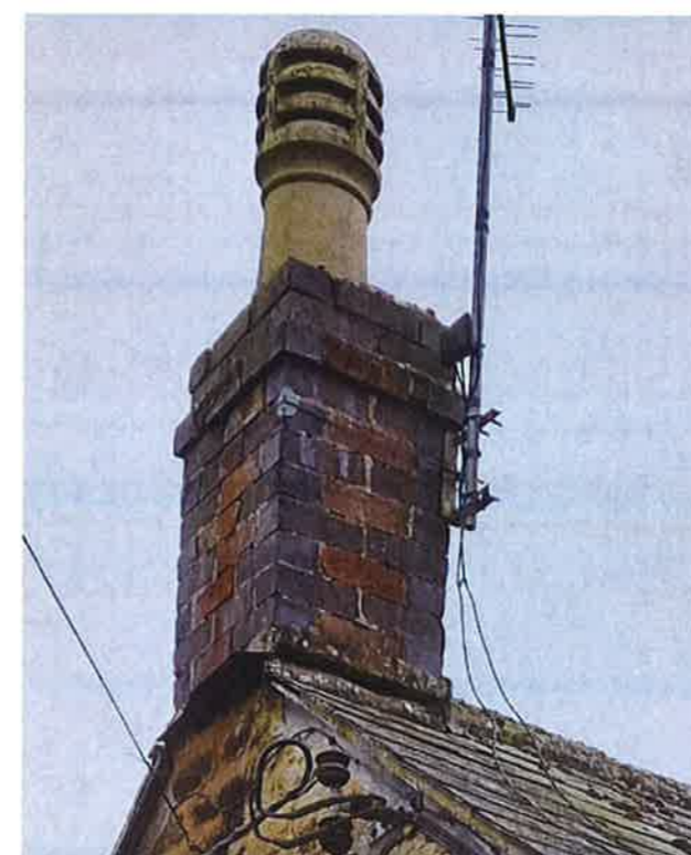
Existing Chimney Photos