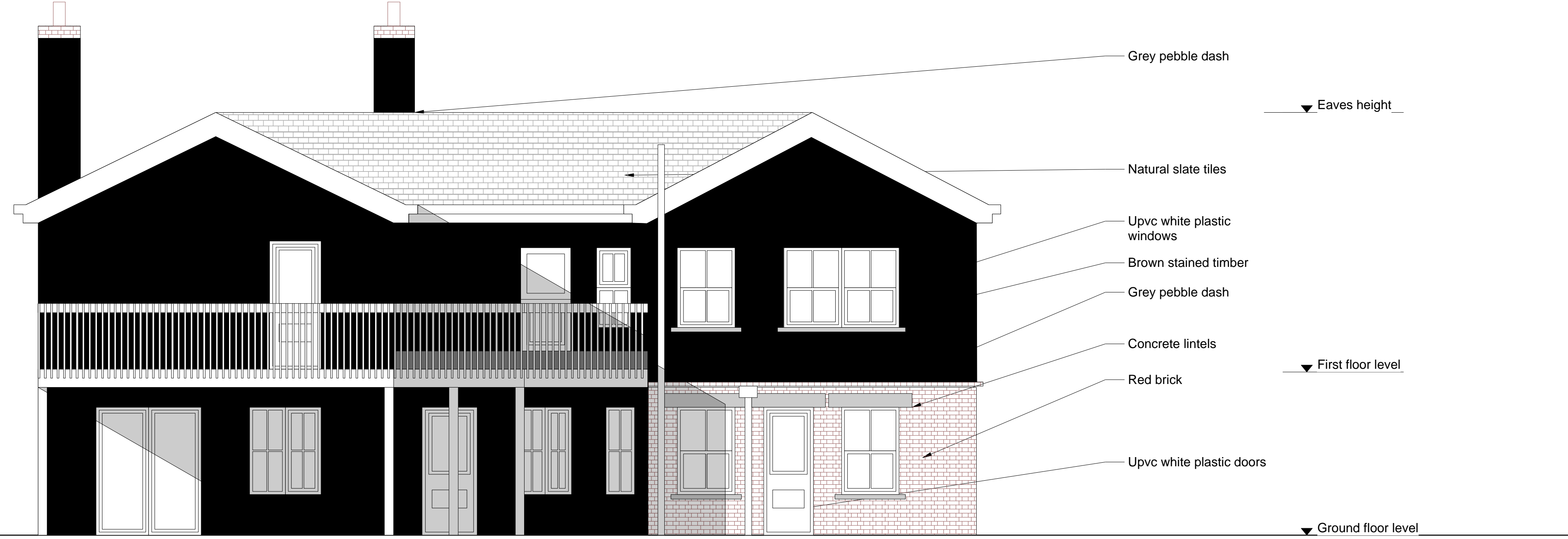
1 EXISTING REAR ELEVATION Scale: 1:50