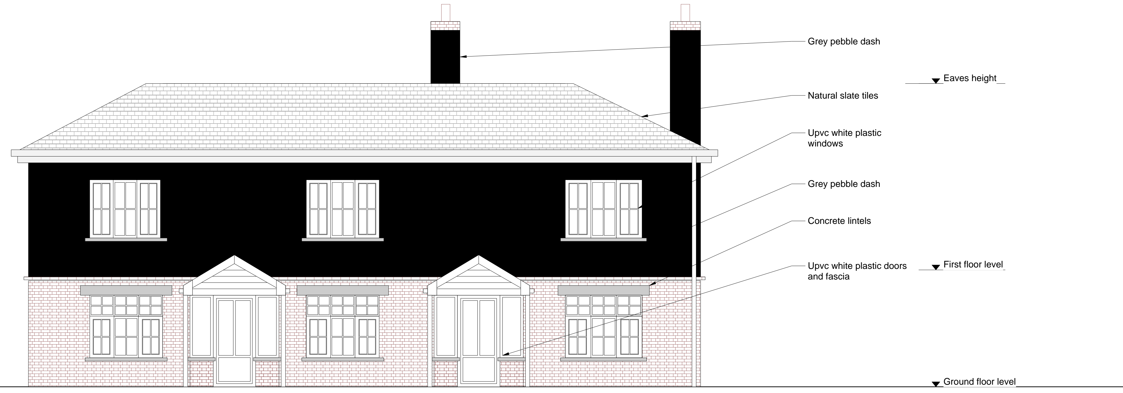
1 EXISTING FRONT ELEVATION Scale: 1:50

General Notes This drawing is prepared solely for design and planning submission purposes. It is not intended or suitable for either Building Regulations or Construction purposes and should not be used for such. Any discrepancies or queries should be brought to the attention of the authors. PENN & SETT retains copyright of these drawings and the work depicted on them. No unauthorised reproduction of work. Whilst all reasonable efforts are used to ensure drawings are accurate, PENN & SETT accept no responsibility or liability for any reliance on these drawings for purposes other than those stated.