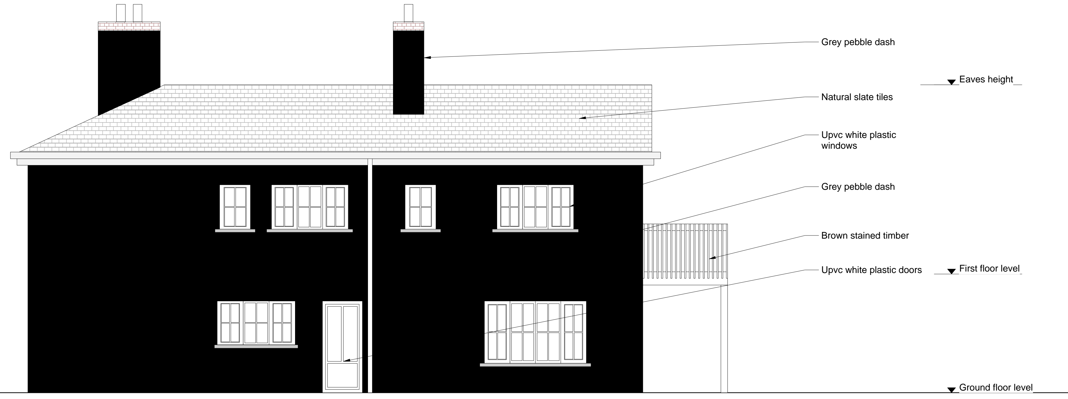
1 EXISTING EAST ELEVATION Scale: 1:50

General Notes This drawing is prepared solely for design and planning submission purposes. It is not intended or suitable for either Building Regulations or Construction purposes and should not be used for such. Any discrepancies or queries should be brought to the attention of the authors. PENN & SETT retains copyright of these drawings and the work depicted on them. No unauthorised reproduction of work. Whilst all reasonable efforts are used to ensure drawings are accurate, PENN & SETT accept no responsibility or liability for any reliance on these drawings for purposes other than those stated.