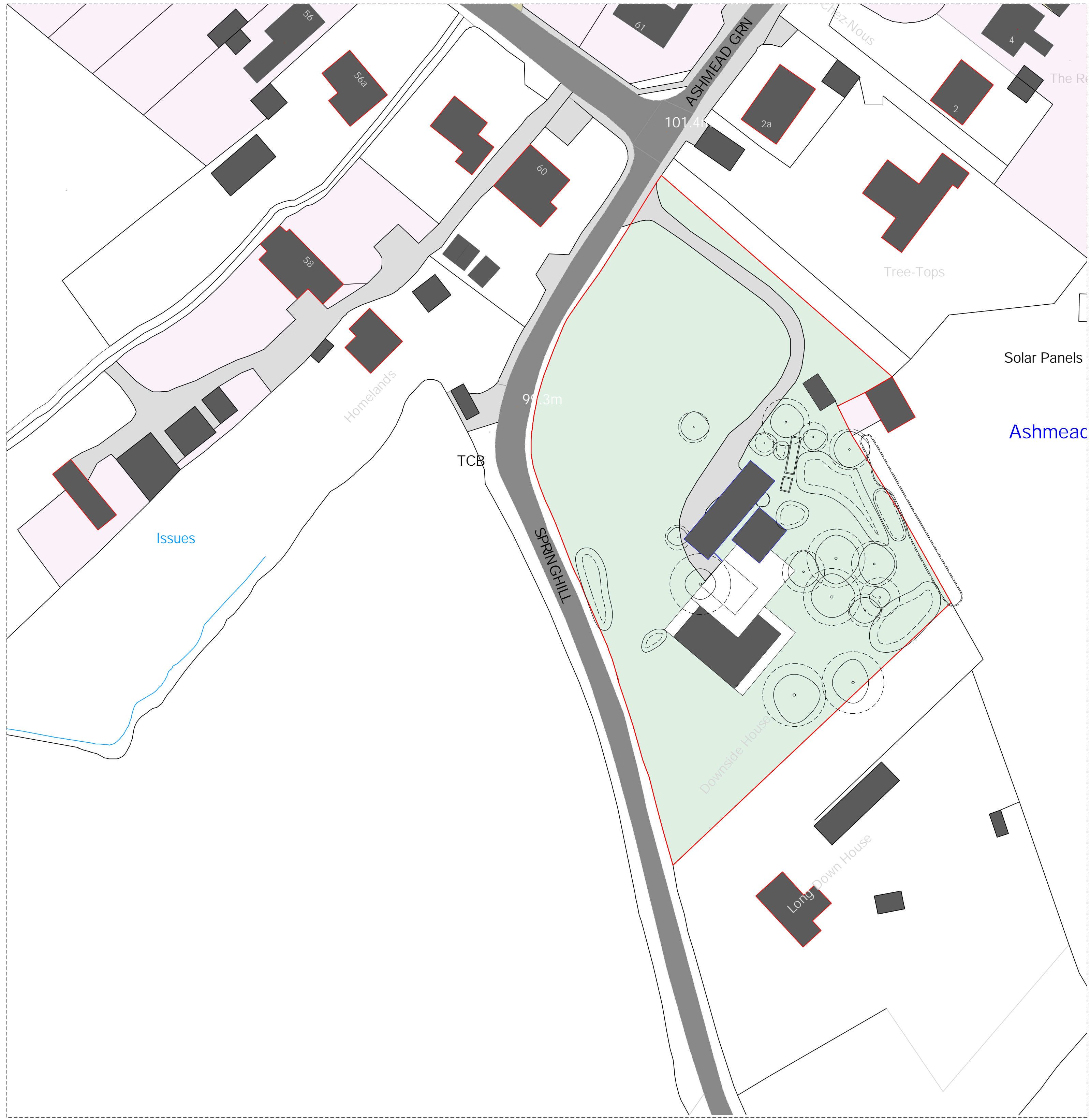
1 EXISTING GROUND BLOCK PLAN Scale: 1:500

General Notes This drawing is prepared solely for design and planning submission purposes. It is not intended or suitable for either Building Regulations or Construction purposes and should not be used for such. Any discrepancies or queries should be brought to the attention of the authors. PENN & SETT retains copyright of these drawings and the work depicted on them. No unauthorised reproduction of work. Whilst all reasonable efforts are used to ensure drawings are accurate, PENN & SETT accept no responsibility or liability for any reliance on these drawings for purposes other than those stated.